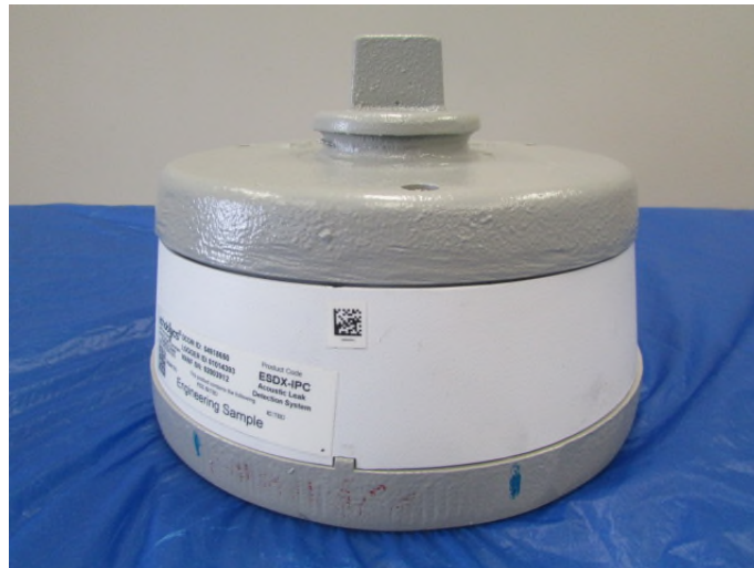
Figure 5: Host EchoShore – DX (Side view)