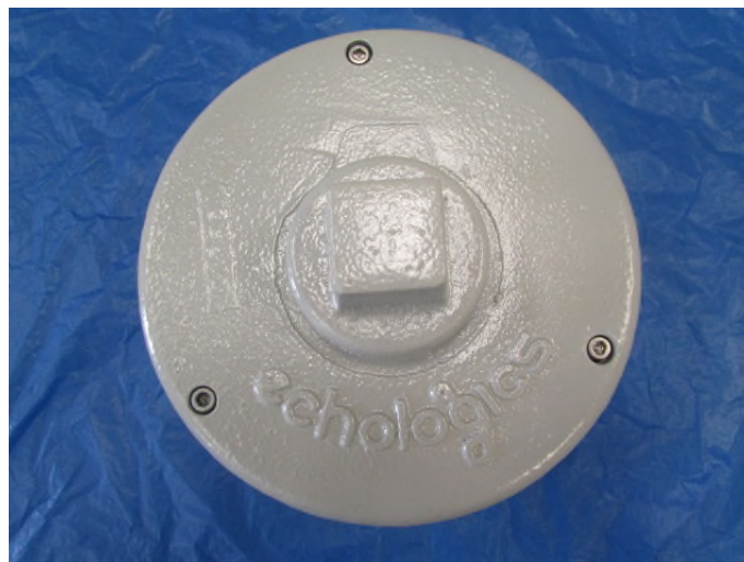
Figure 2: Host EchoShore – DX (Top view)