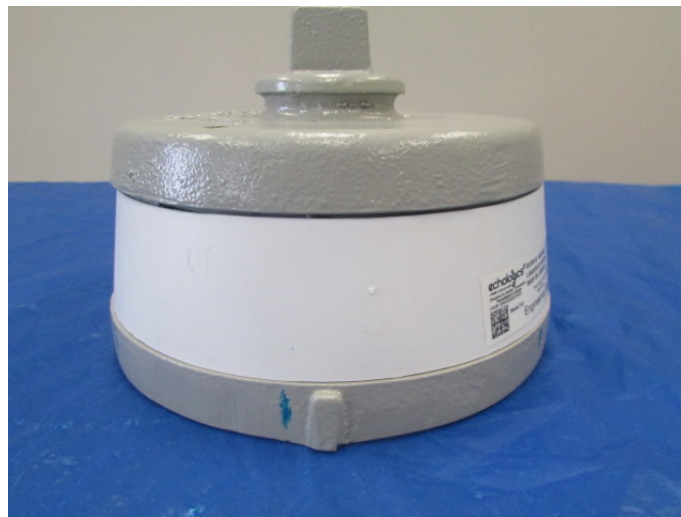
Figure 7: Host EchoShore – DX (Side view)