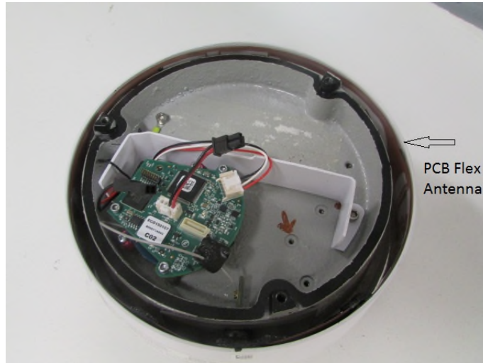
Figure 1: Module and Antenna installed in Host EchoShore - DX