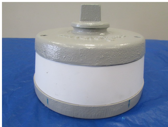
Figure 4: Host EchoShore – DX (Side view)