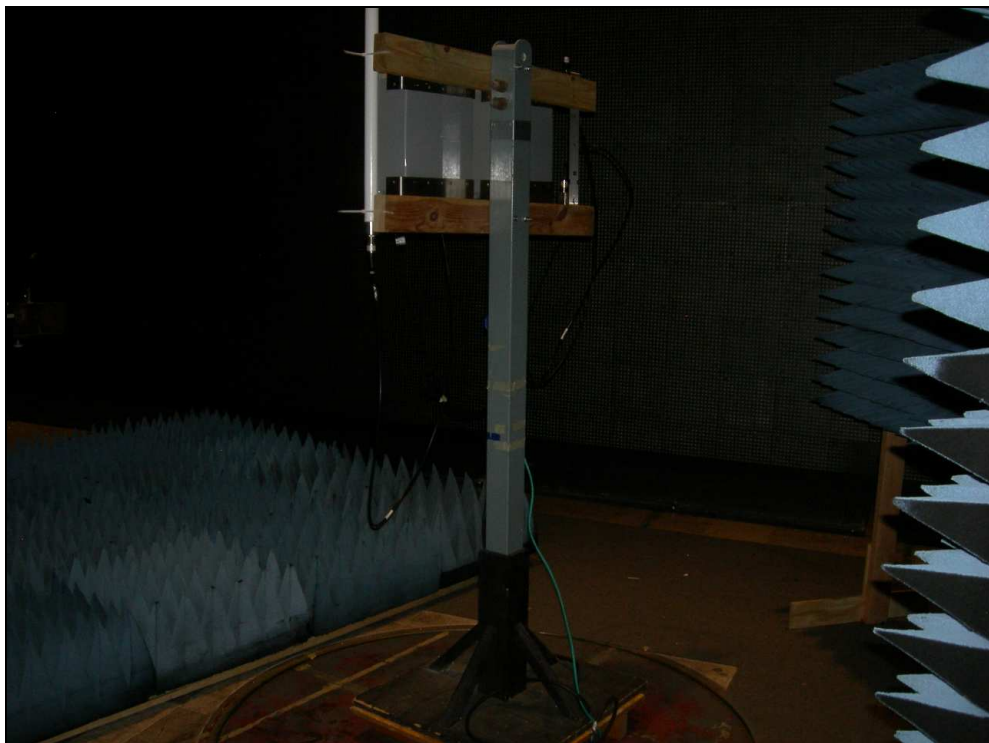
Figure 2: Radiated Emissions