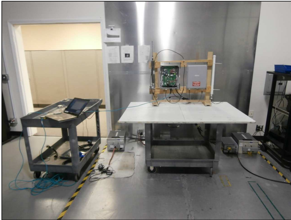
Figure 3: Conducted Emissions