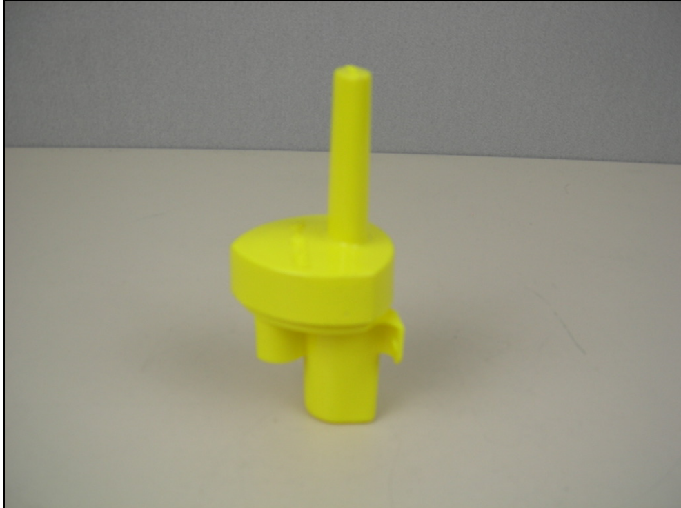
Figure 4: External Photo