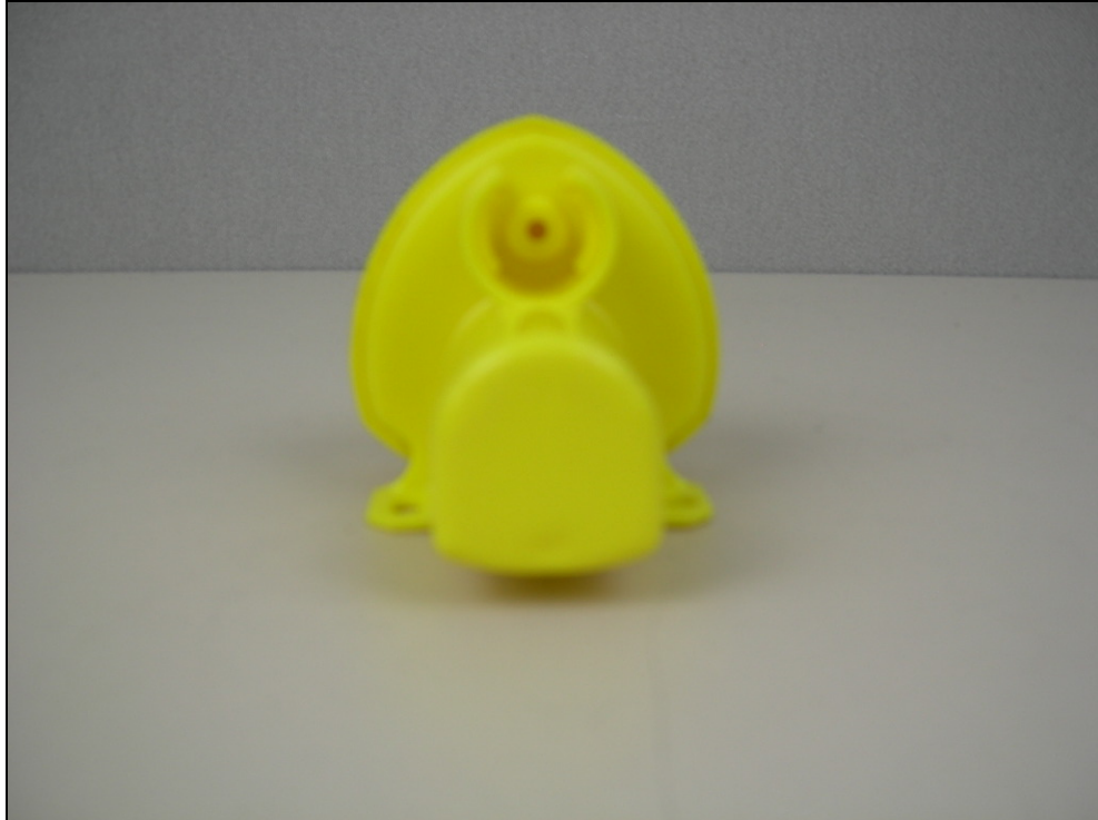
Figure 6: External Photo