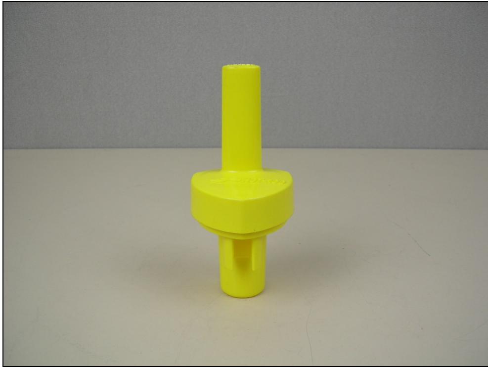
Figure 1: External Photo