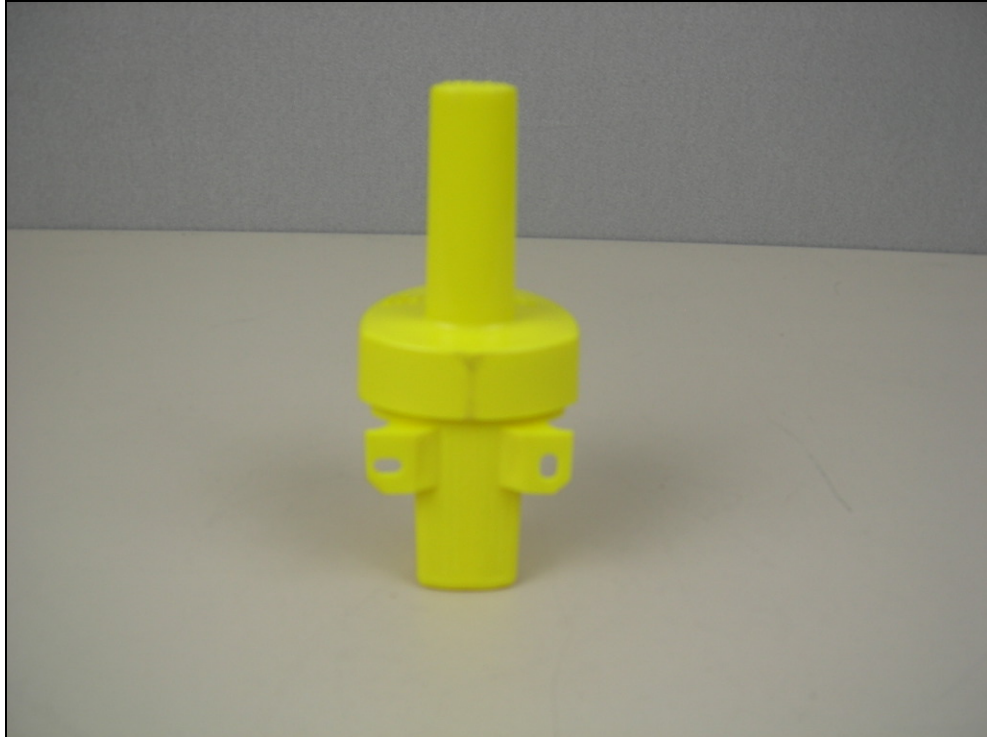
Figure 2: External Photo