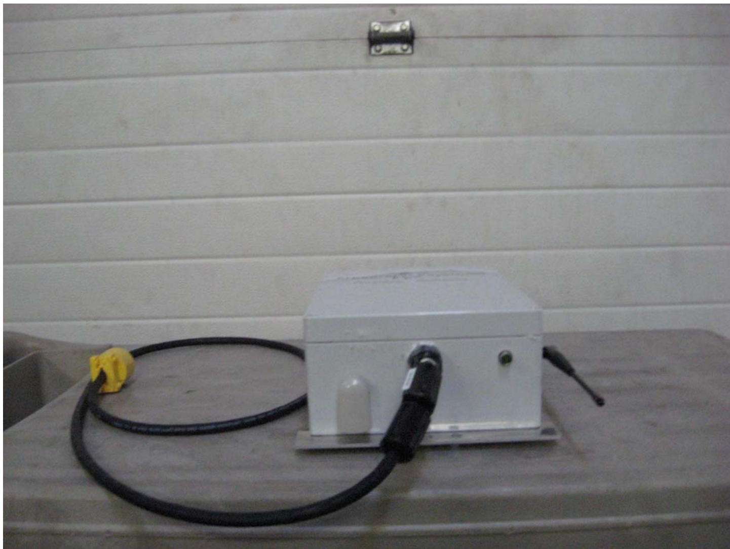
Power Entry Side