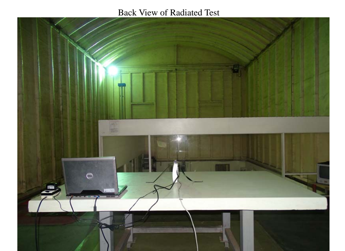
Page: 2 of 4