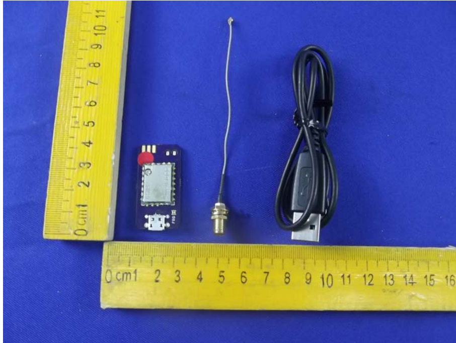
Figure 2 The Overall View of Antenna 1 (Model No.: ANT-900MS/MR)