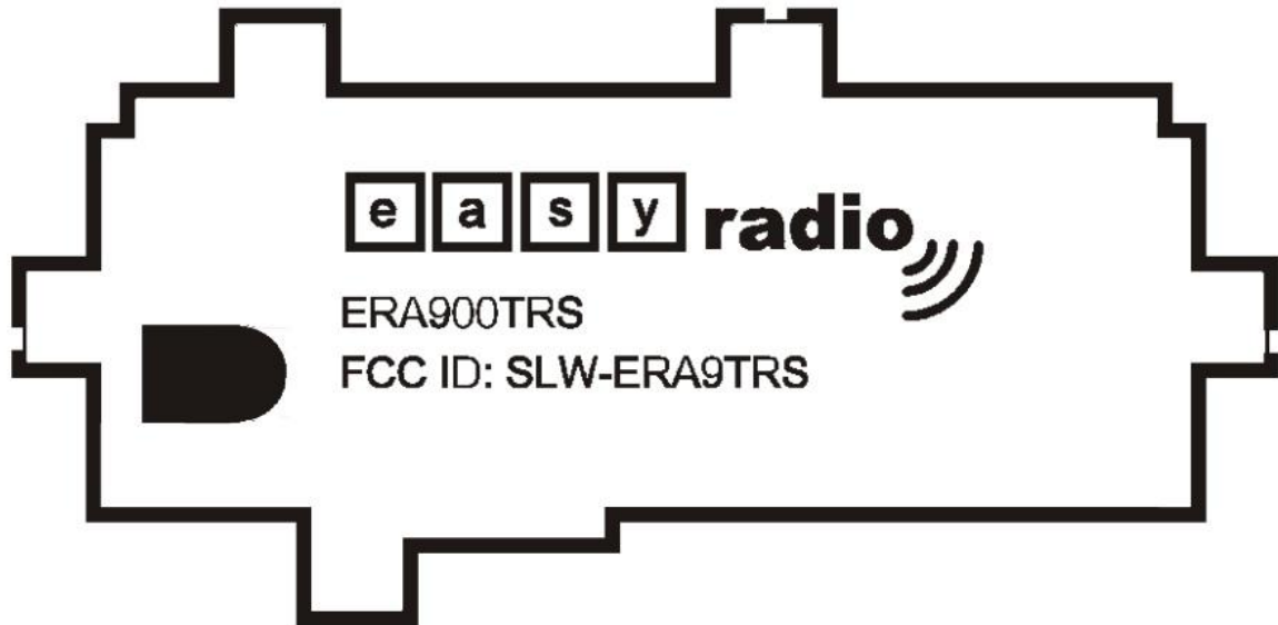
Figure 1: label artwork

The FCC ID will be etched into the sheilding can (Fig.2) with the information from Fig.1.