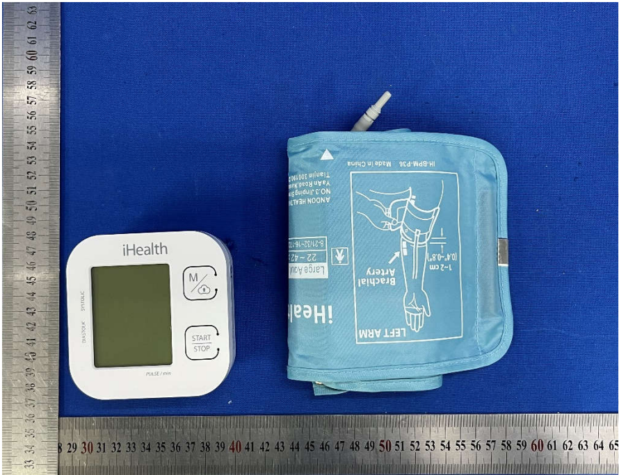
View of Product-01