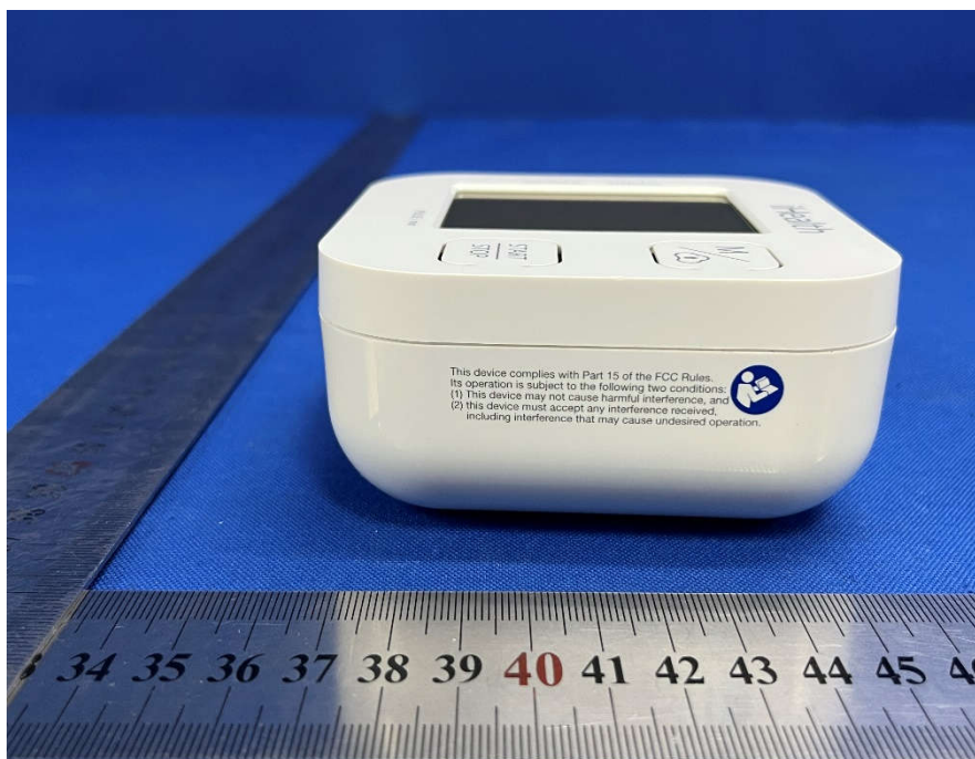
View of Product-05