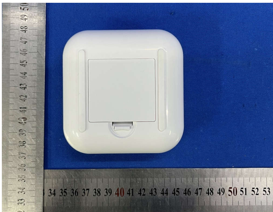
View of Product-03