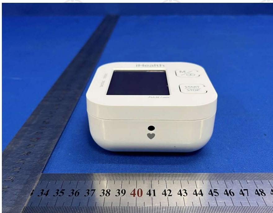
View of Product-06