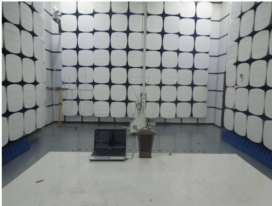
Photos of Radiated emission