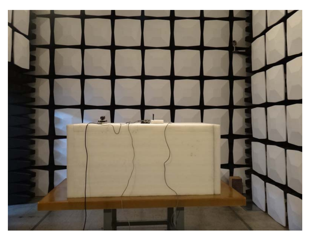
Back View of Radiated Test (Horn)