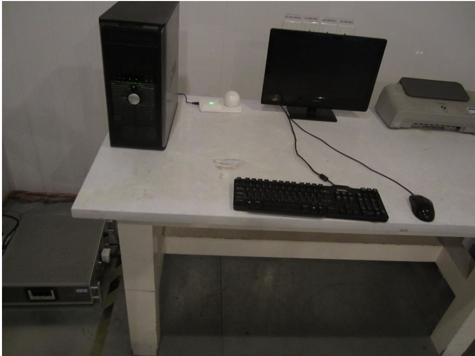
Setup for Conducted Emission