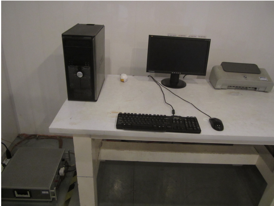
Setup for Conducted Emission