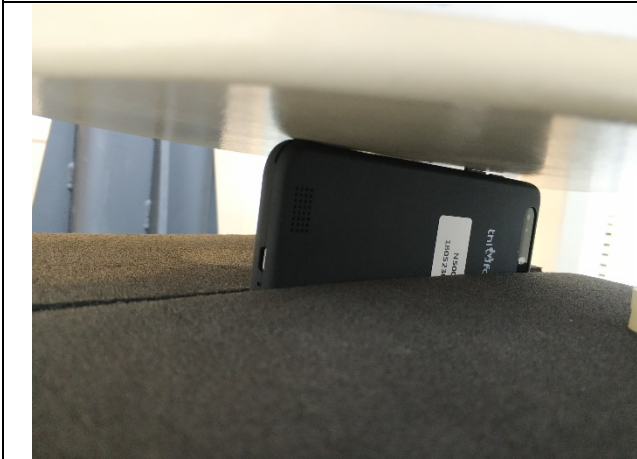
FLAT position, EDGE3(0mm)