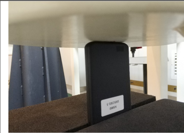
FLAT position, EDGE2(0mm)