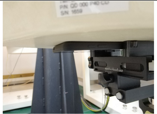
FLAT position, Towards ground(0mm)