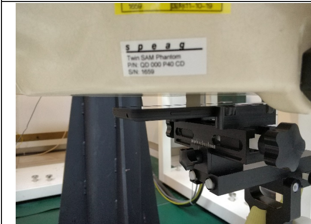
FLAT position, Towards phantom(10mm)