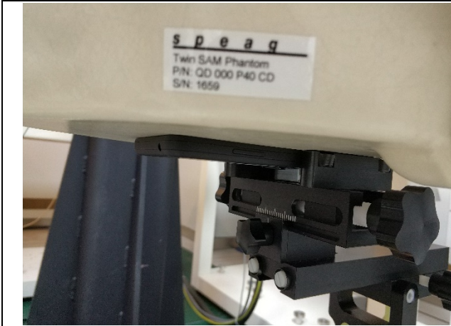
FLAT position, Towards phantom(0mm)