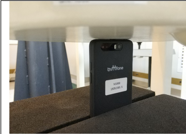
FLAT position, EDGE1(0mm)