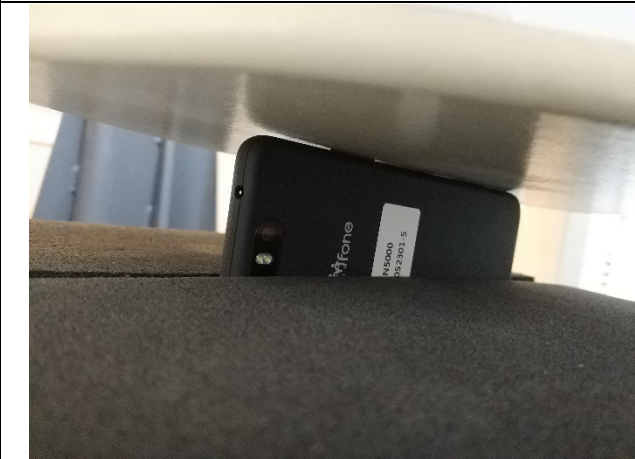
FLAT position, EDGE4(0mm)