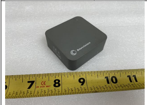
EUT External - Side#1