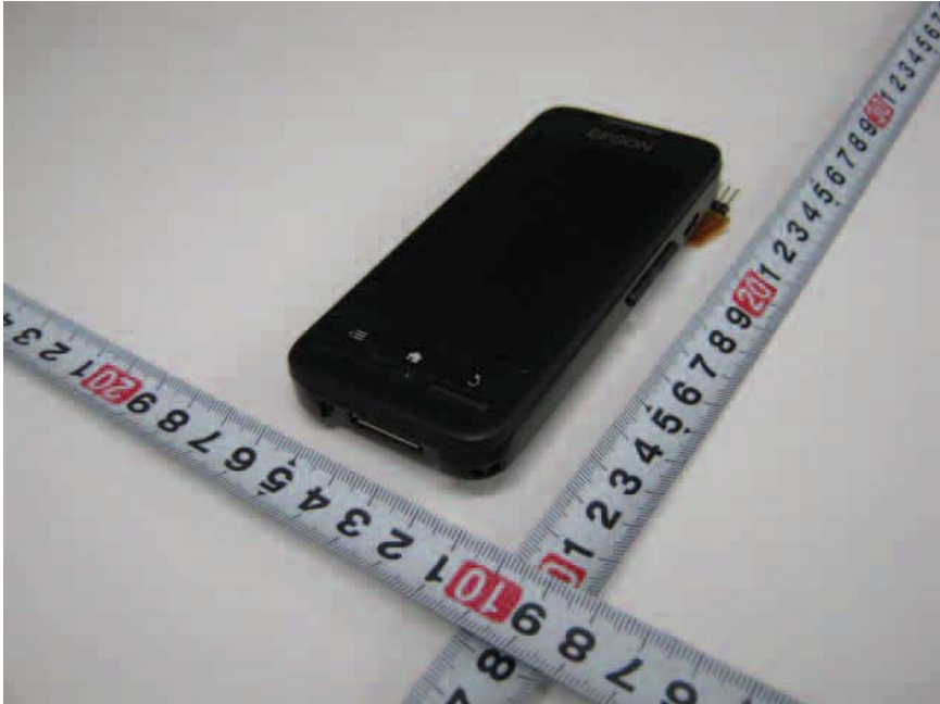
External Photo of EUT