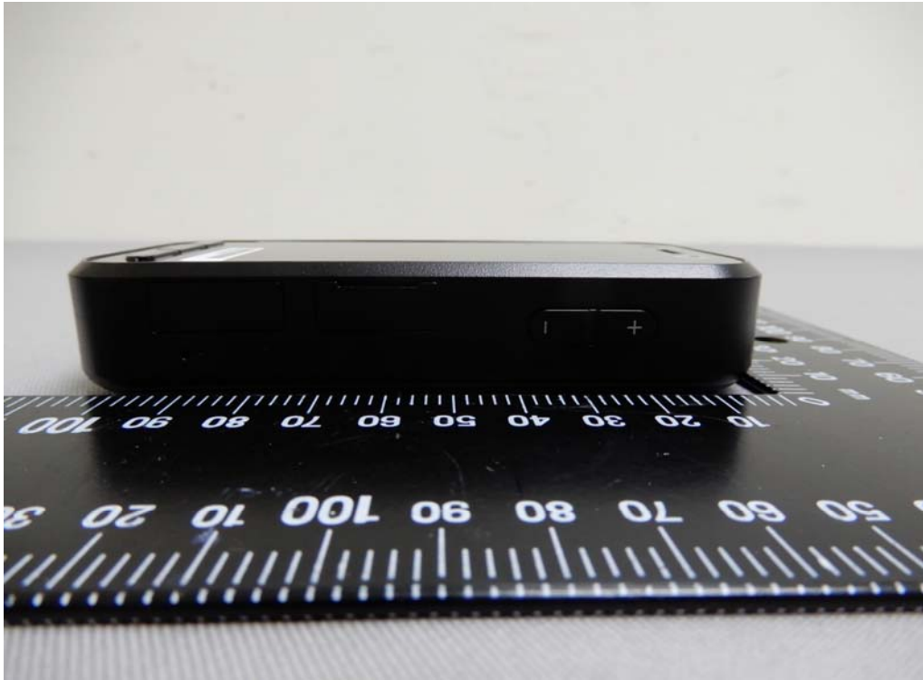
Side View of EUT – 3