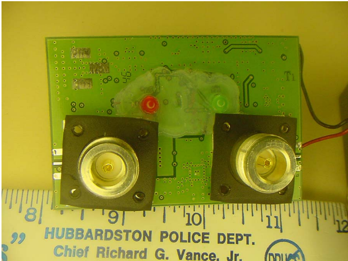
circuit side of amplifier PCB, center is hot glue around the indicator LEDs, gaskets cover the base of the N connectors.