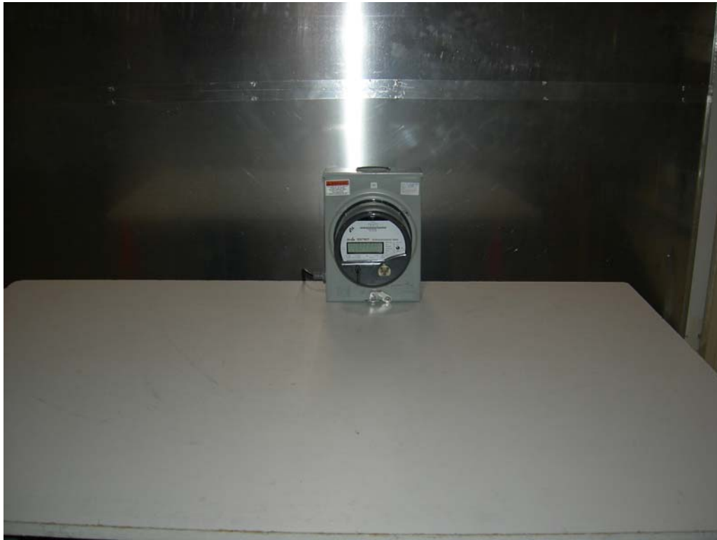
Figure 9: 2S Meter Form Host – AC Power Line Conducted Emissions