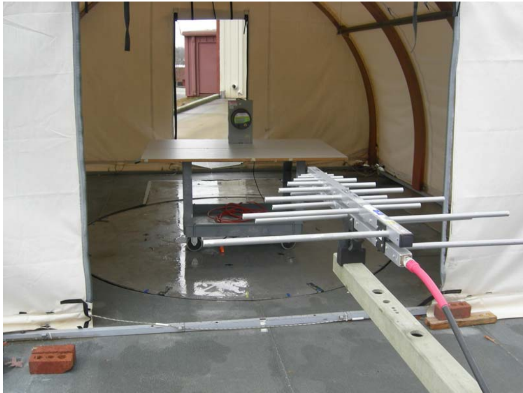
Figure 3: 9S Meter Form Host – Radiated Emissions