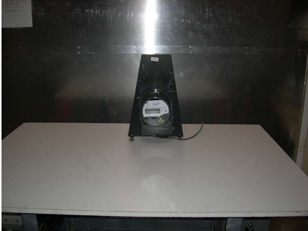
Figure 14: 45A Meter Form Host – AC Power Line Conducted Emissions