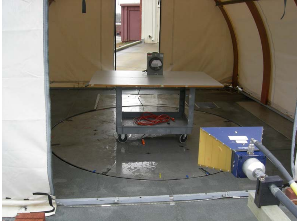
Figure 2: 3S Meter Form Host – Radiated Emissions