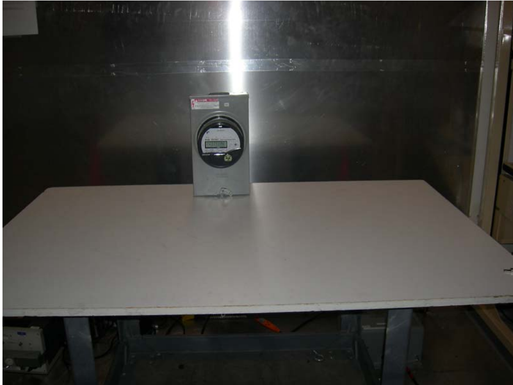
Figure 15: 45S Meter Form Host – AC Power Line Conducted Emissions