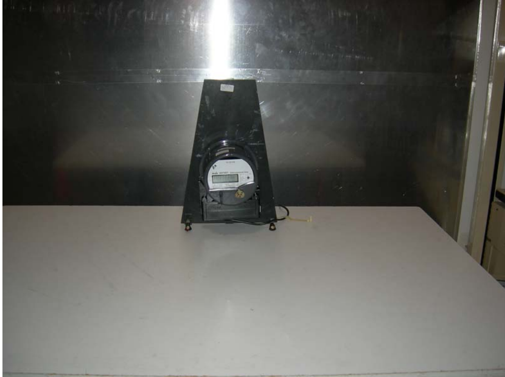
Figure 12: 16A Meter Form Host – AC Power Line Conducted Emissions