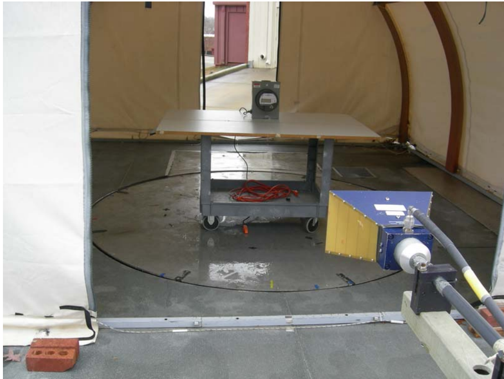
Figure 1: 2S Meter Form Host – Radiated Emissions