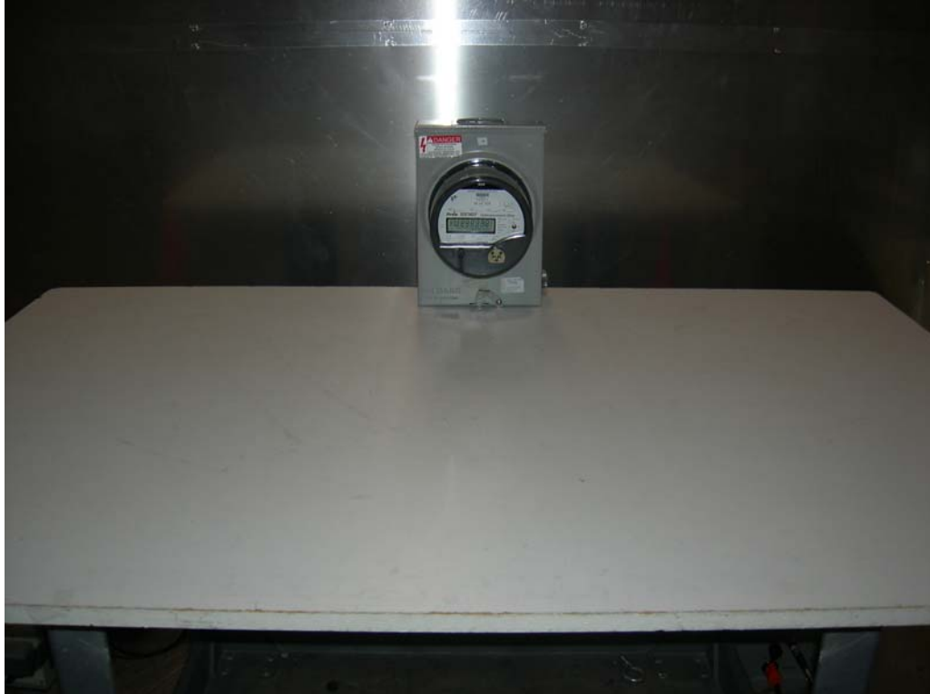
Figure 10: 3S Meter Form Host – AC Power Line Conducted Emissions