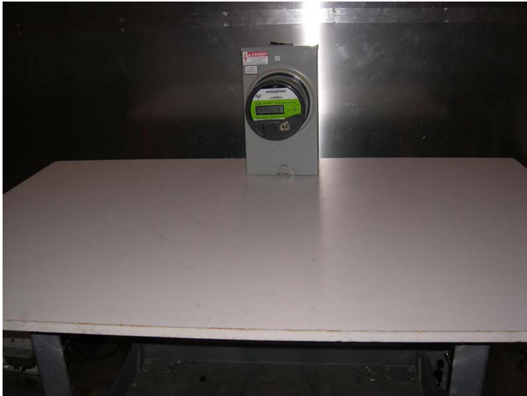
Figure 11: 9S Meter Form Host – AC Power Line Conducted Emissions