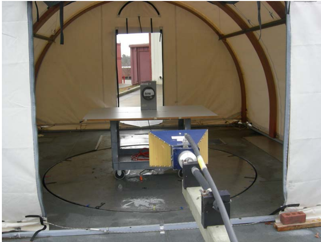
Figure 7: 45S Meter Form Host – Radiated Emissions