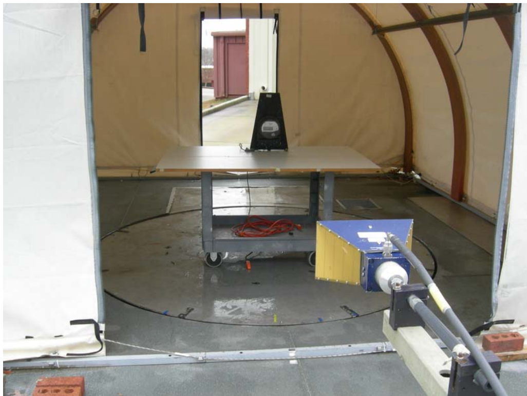
Figure 4: 16A Meter Form Host – Radiated Emissions