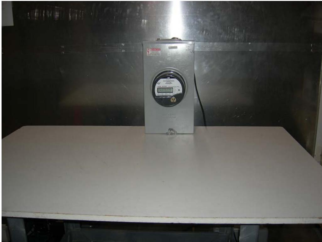
Figure 13: 16S Meter Form Host – AC Power Line Conducted Emissions