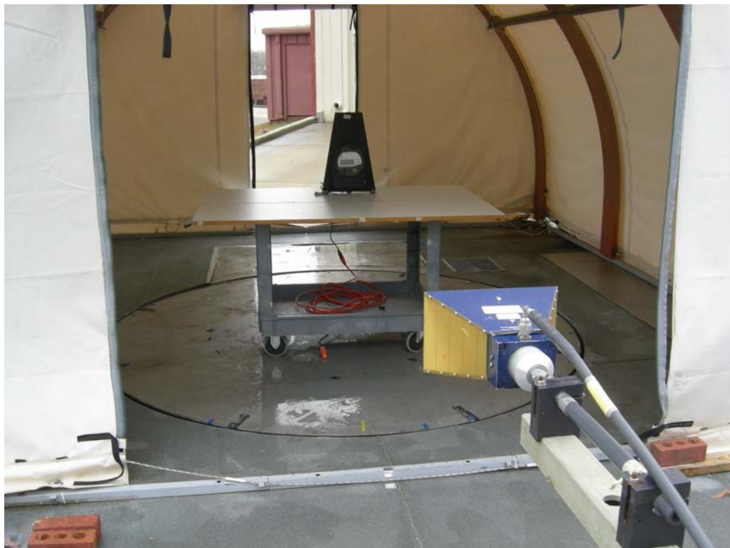
Figure 8: 46A Meter Form Host – Radiated Emissions