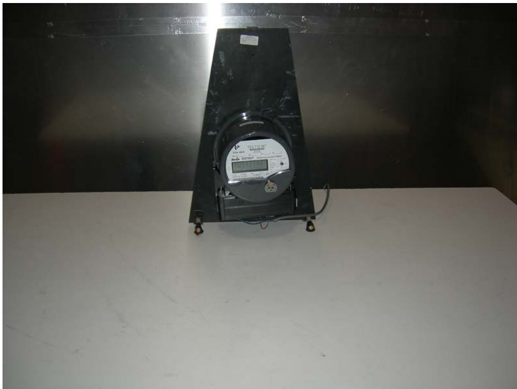
Figure 16: 46A Meter Form Host – AC Power Line Conducted Emissions