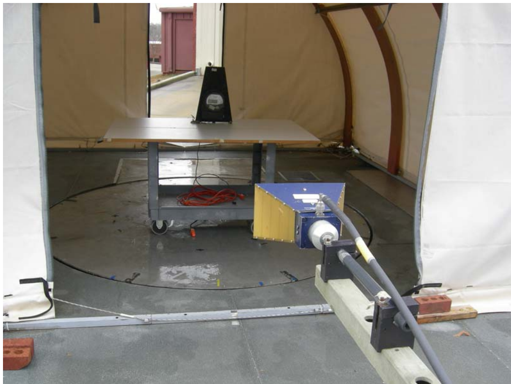
Figure 6: 45A Meter Form Host – Radiated Emissions