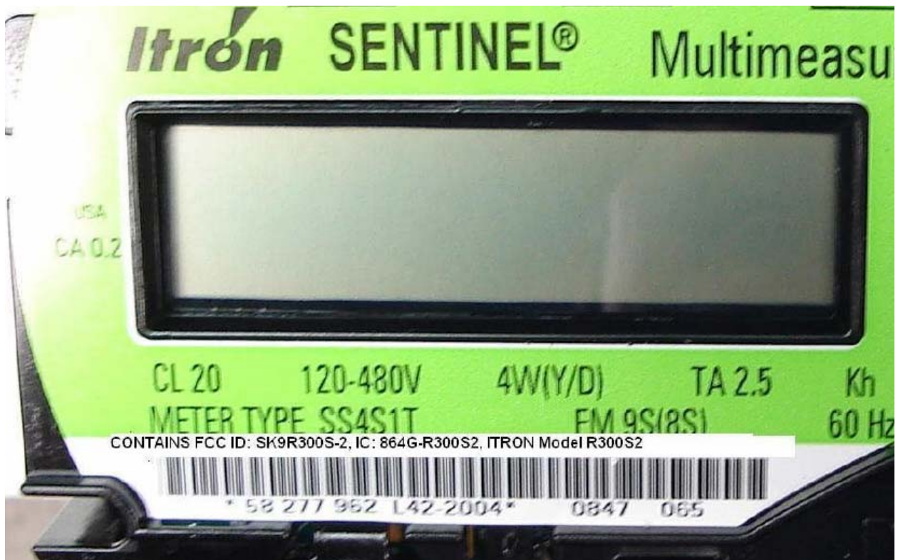
Figure 3: Sample Host Label