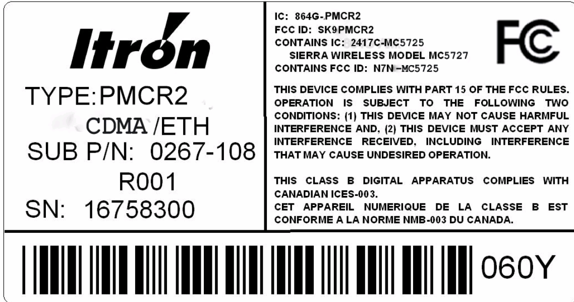
Figure 1: Sample Label