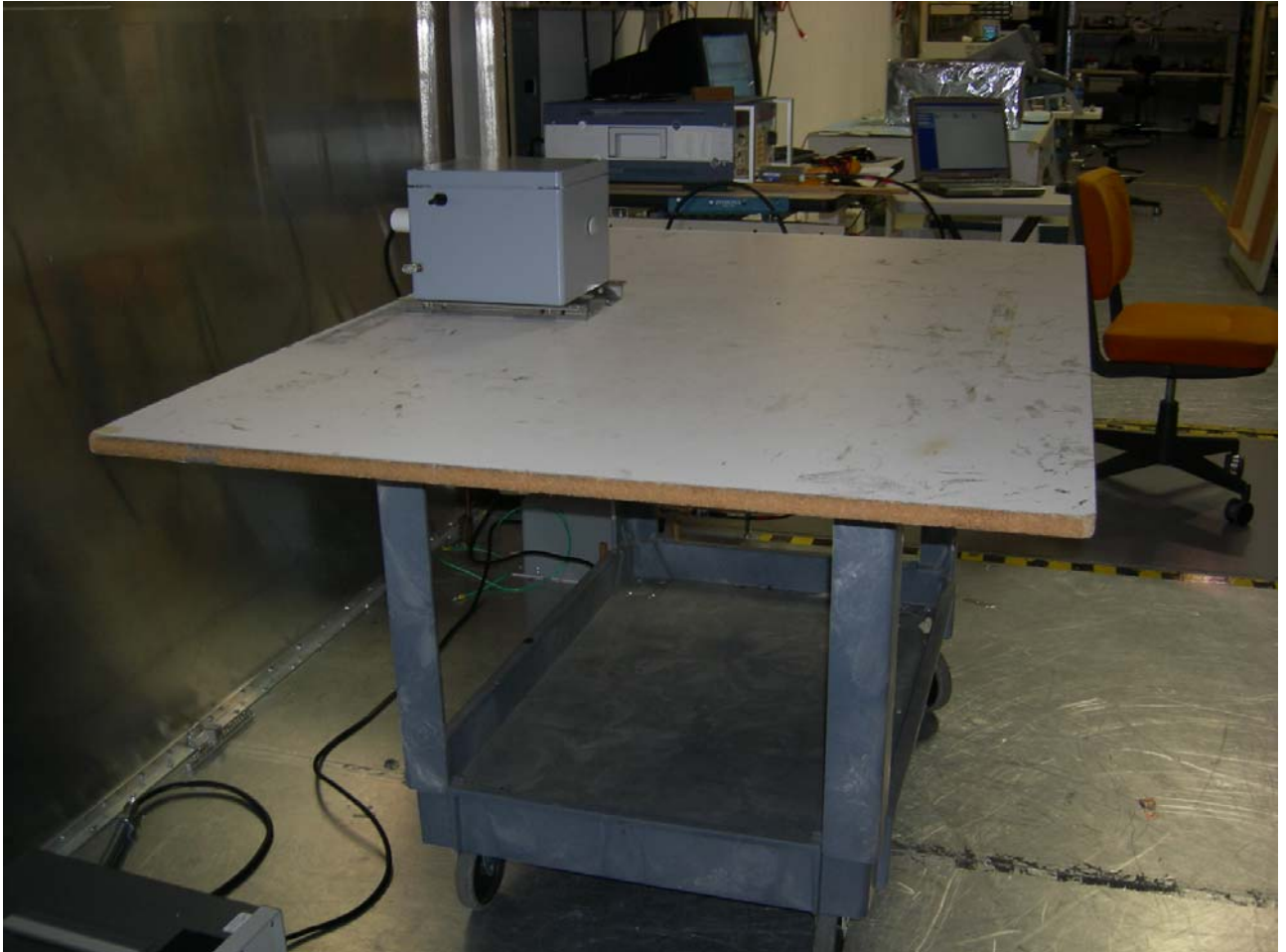
Figure 4: Conducted Emissions – View 2