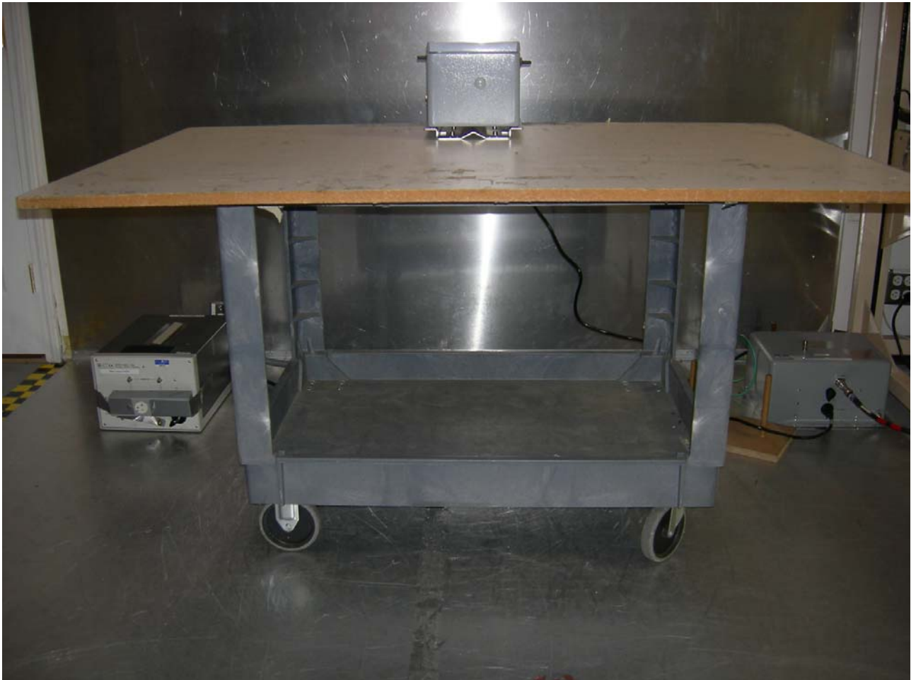
Figure 3: Conducted Emissions – View 2