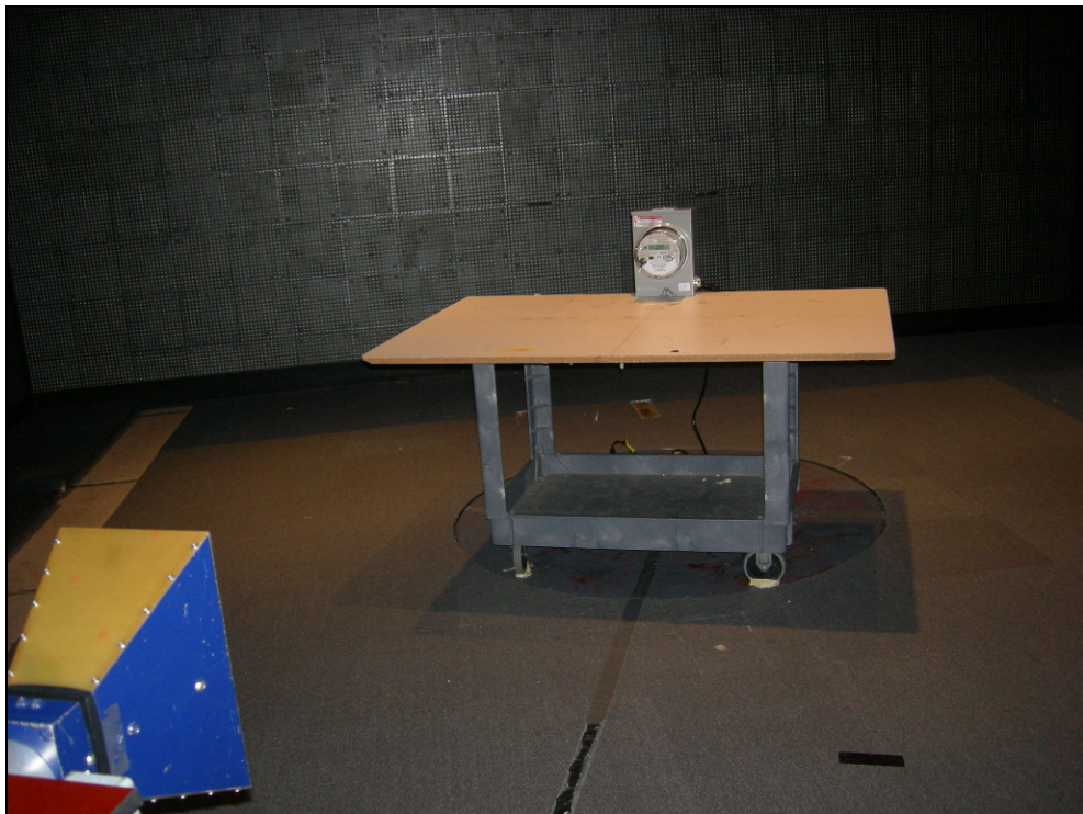
Figure 2: Radiated Emissions