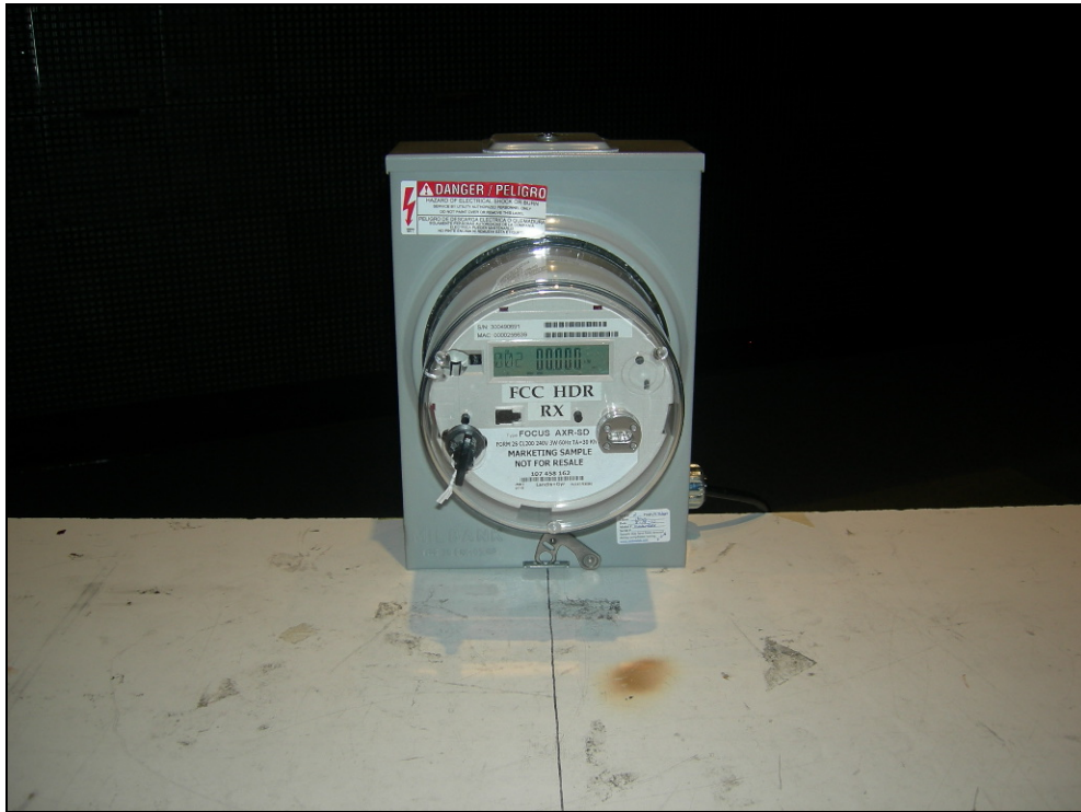
Figure 3: Radiated Emissions