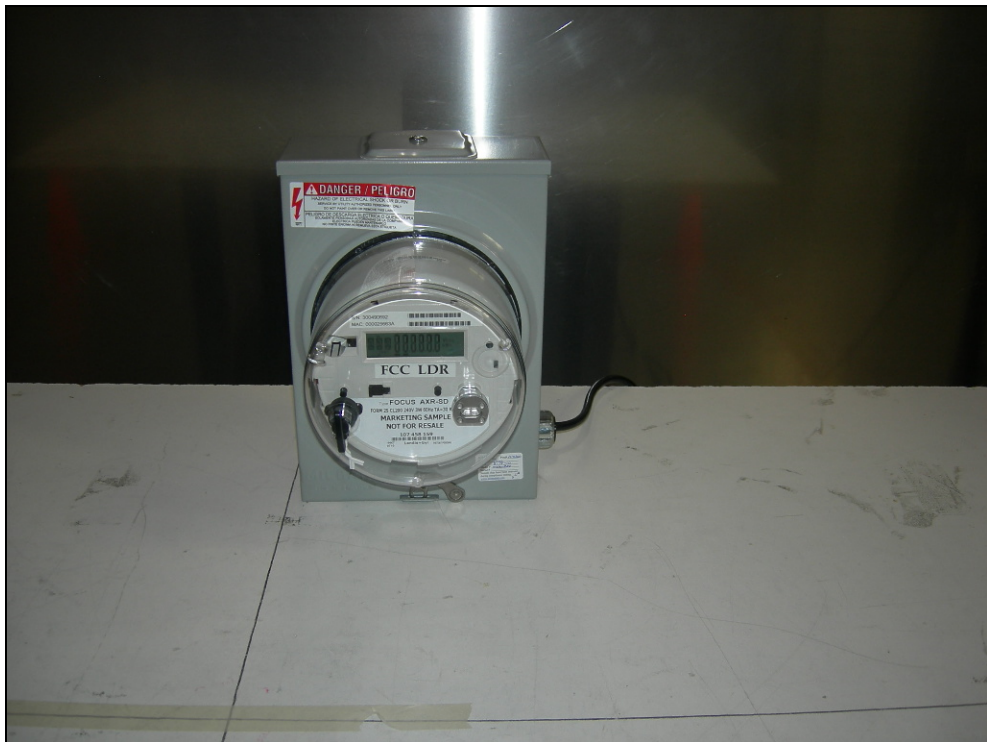
Figure 4: Conducted Emissions