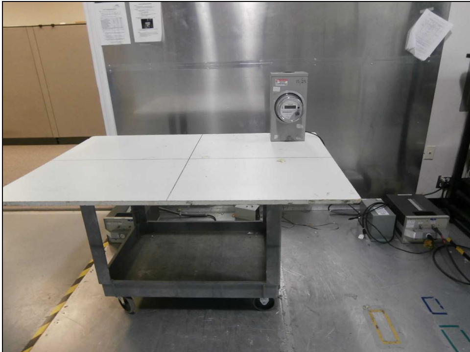
Figure 7: Conducted Emissions – Installed in 1S/2S Meter