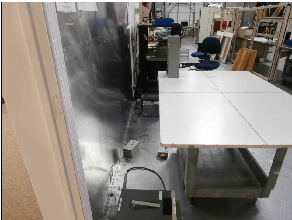
Figure 8: Conducted Emissions – Installed in 1S/2S Meter