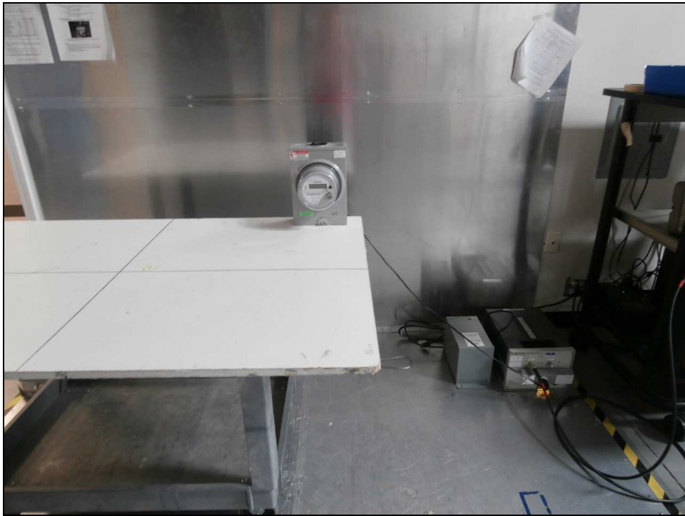
Figure 9: Conducted Emissions – Installed in 12S Meter