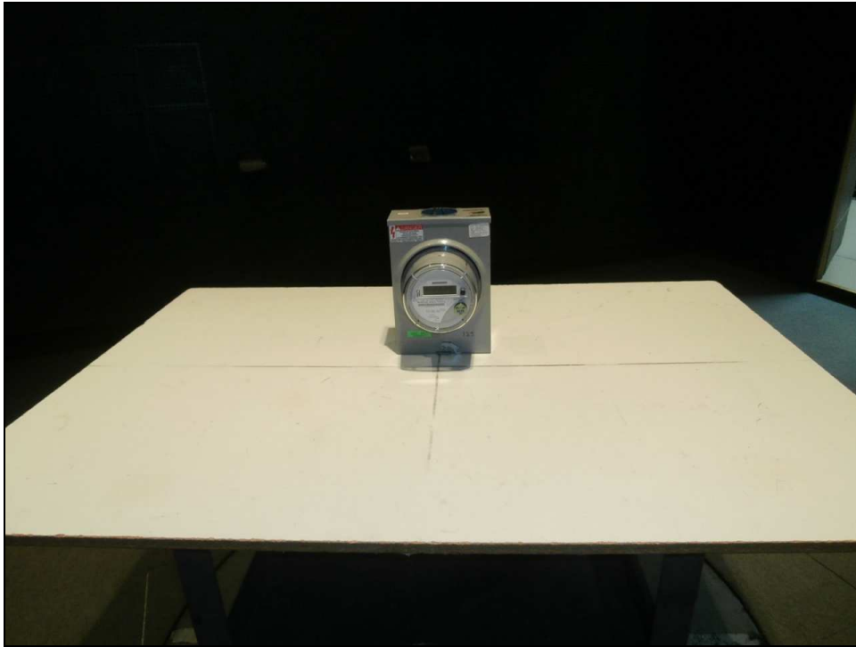
Figure 5: Radiated Emissions – Installed in 12S Meter