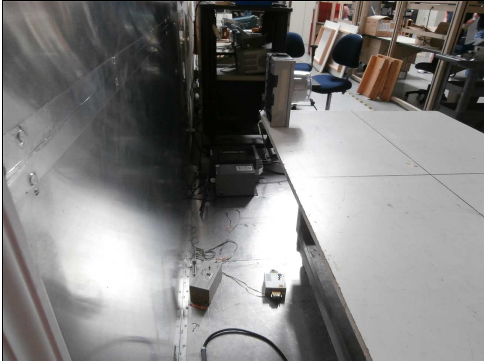
Figure 10: Conducted Emissions – Installed in 12S Meter