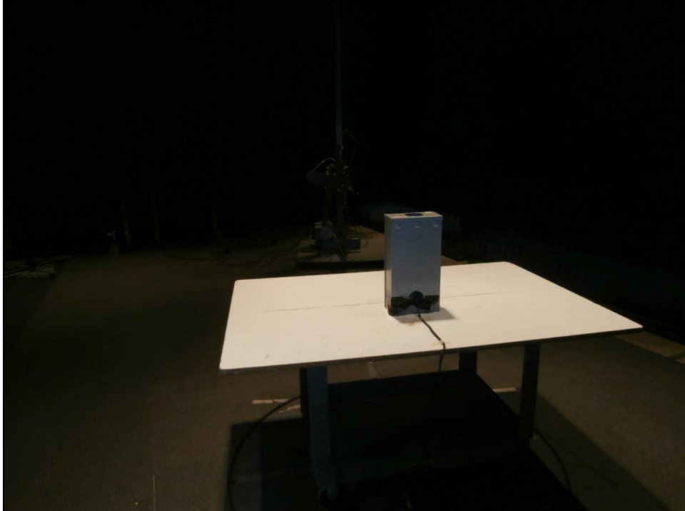
Figure 4: Radiated Emissions – Installed in 2S Meter