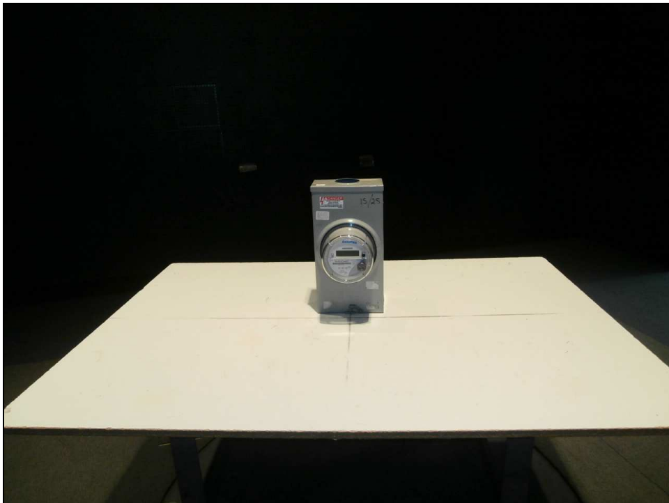
Figure 1: Radiated Emissions – Installed in 1S Meter