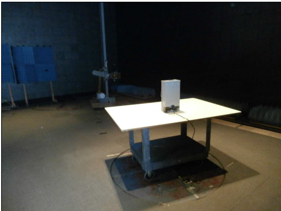
Figure 2: Radiated Emissions – Installed in 1S Meter