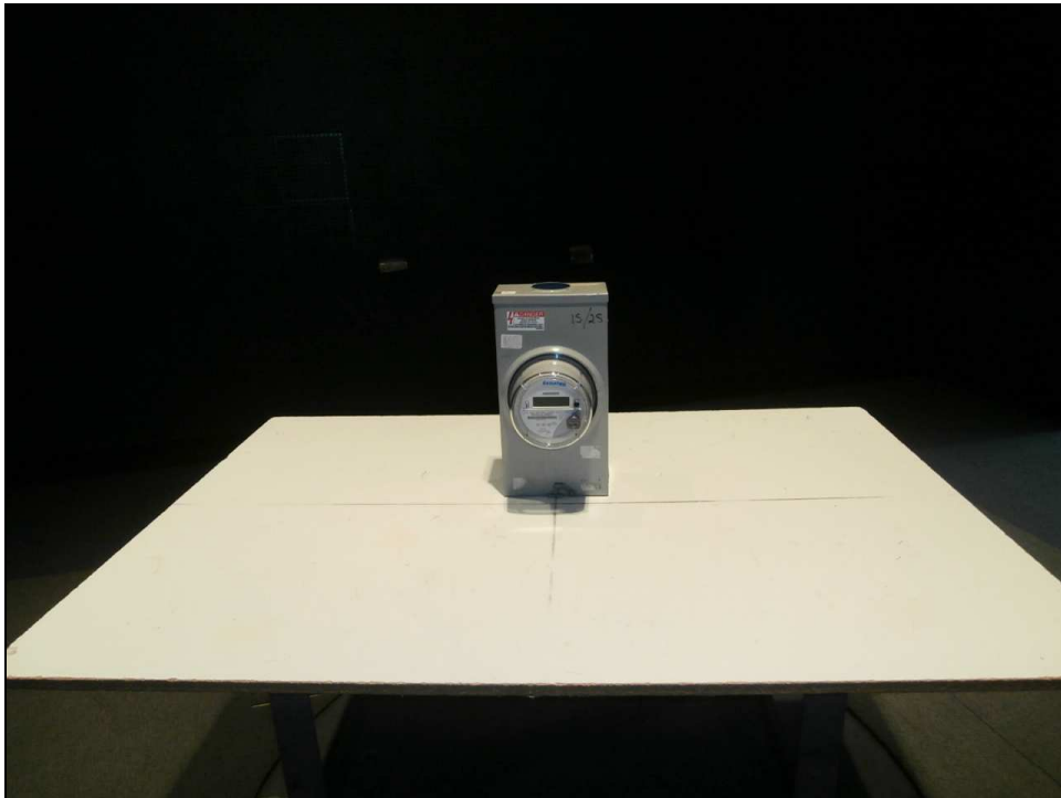
Figure 3: Radiated Emissions – Installed in 2S Meter