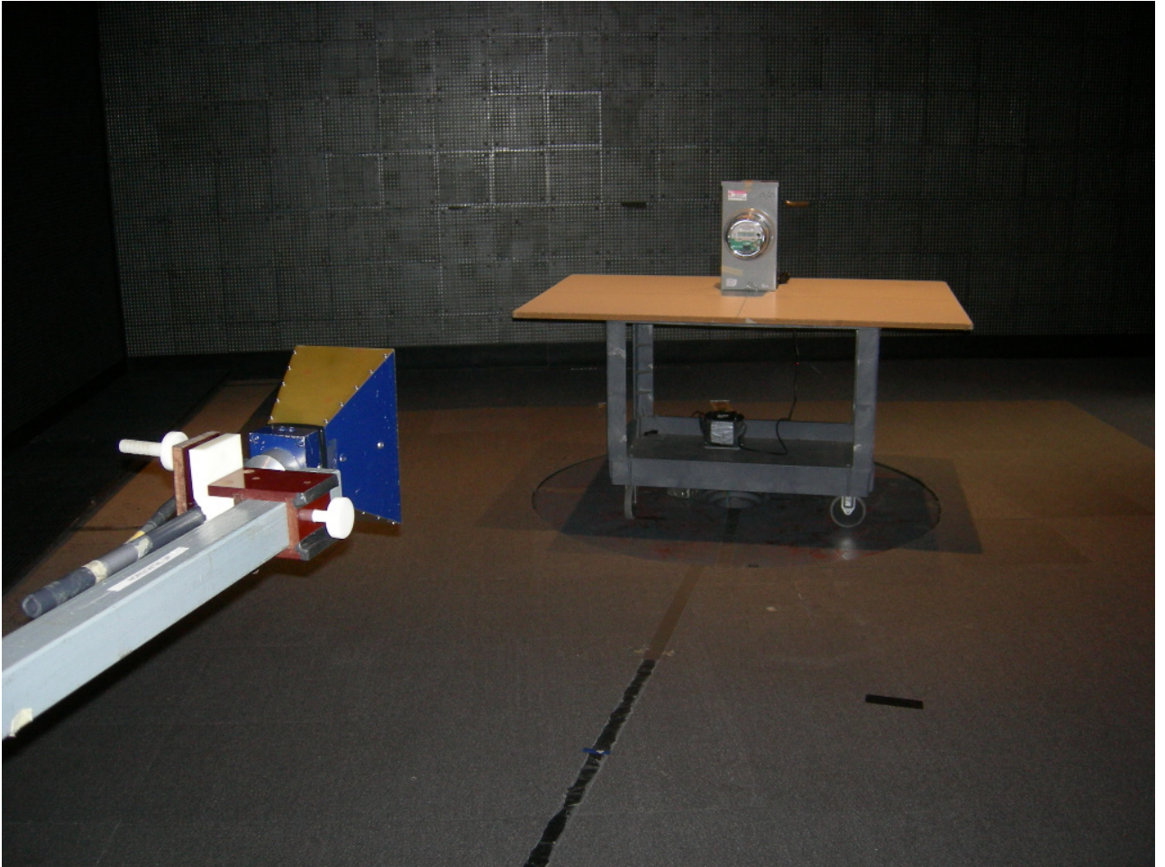
Figure 1: Radiated Emissions – Intentional