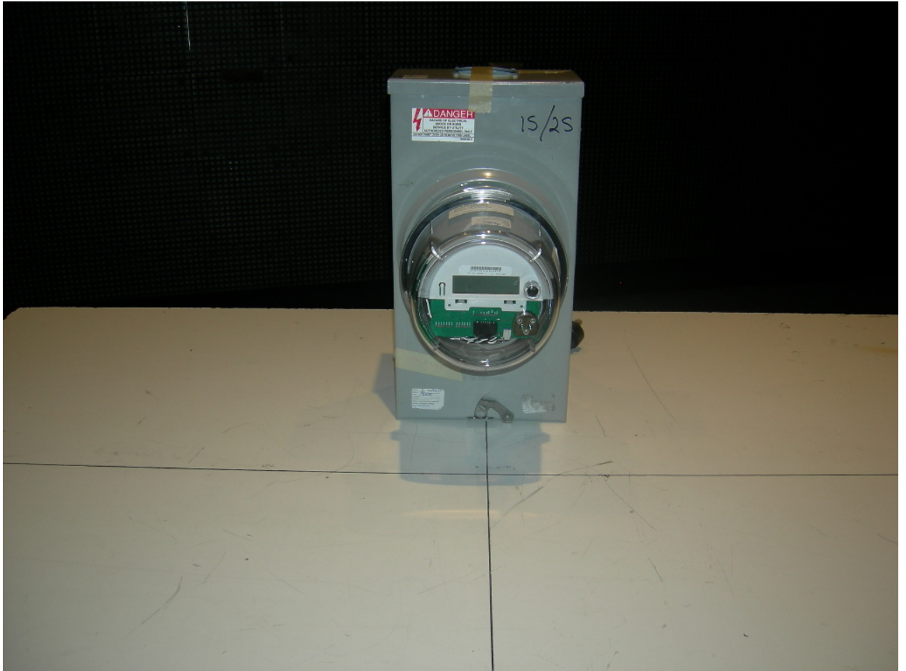
Figure 3: Radiated Emissions – Intentional