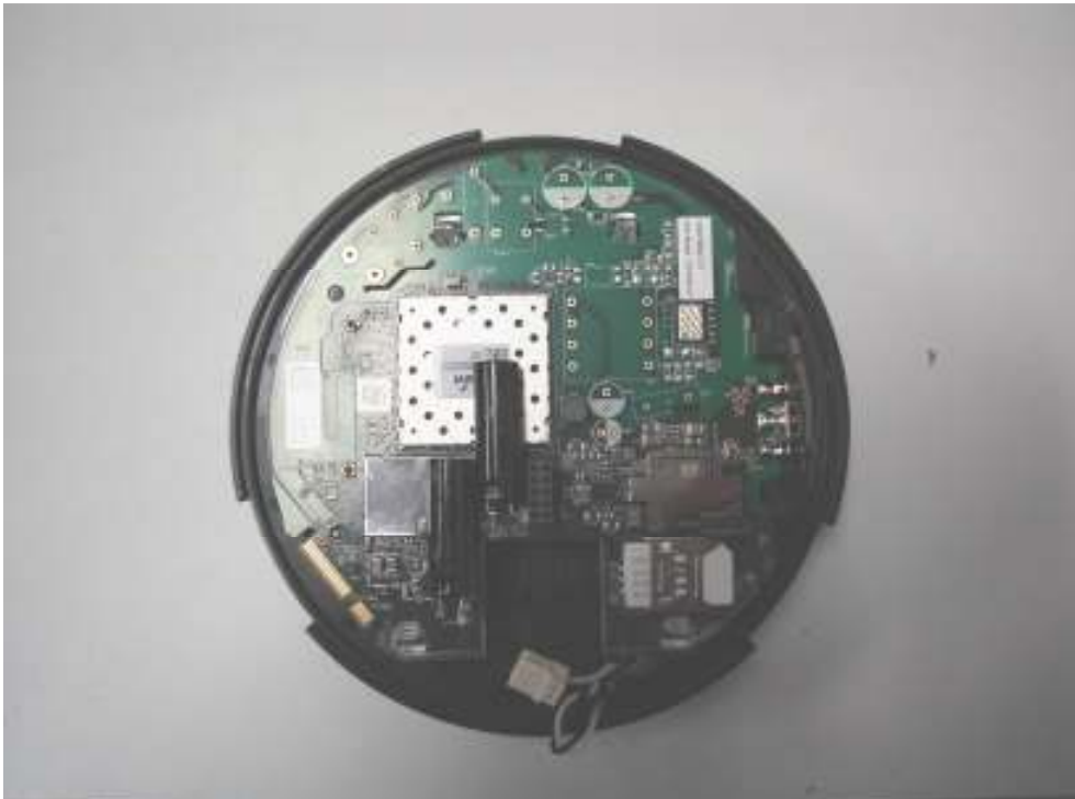
CAT2 Communications Module