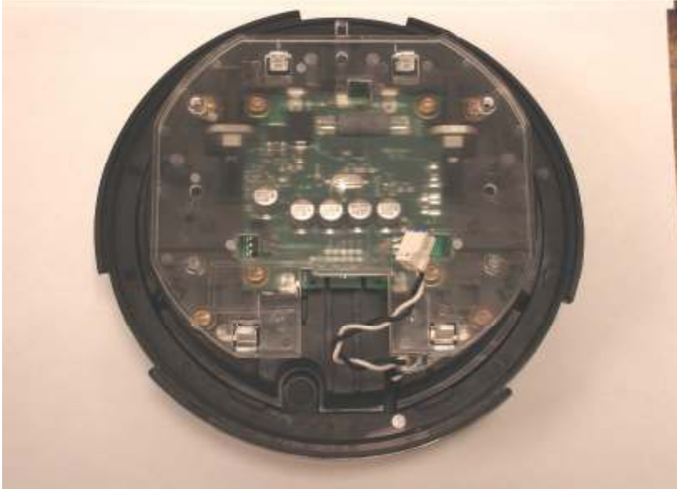
Meter Base with CAT2 module installed