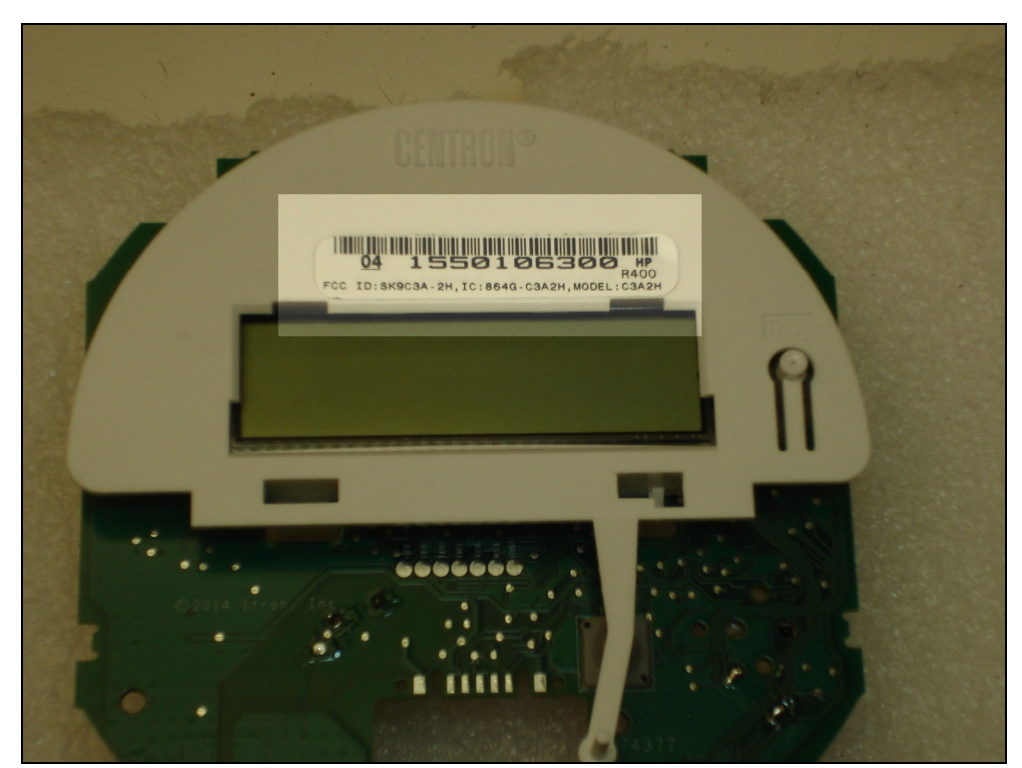
Figure 1: Sample Label and Placement