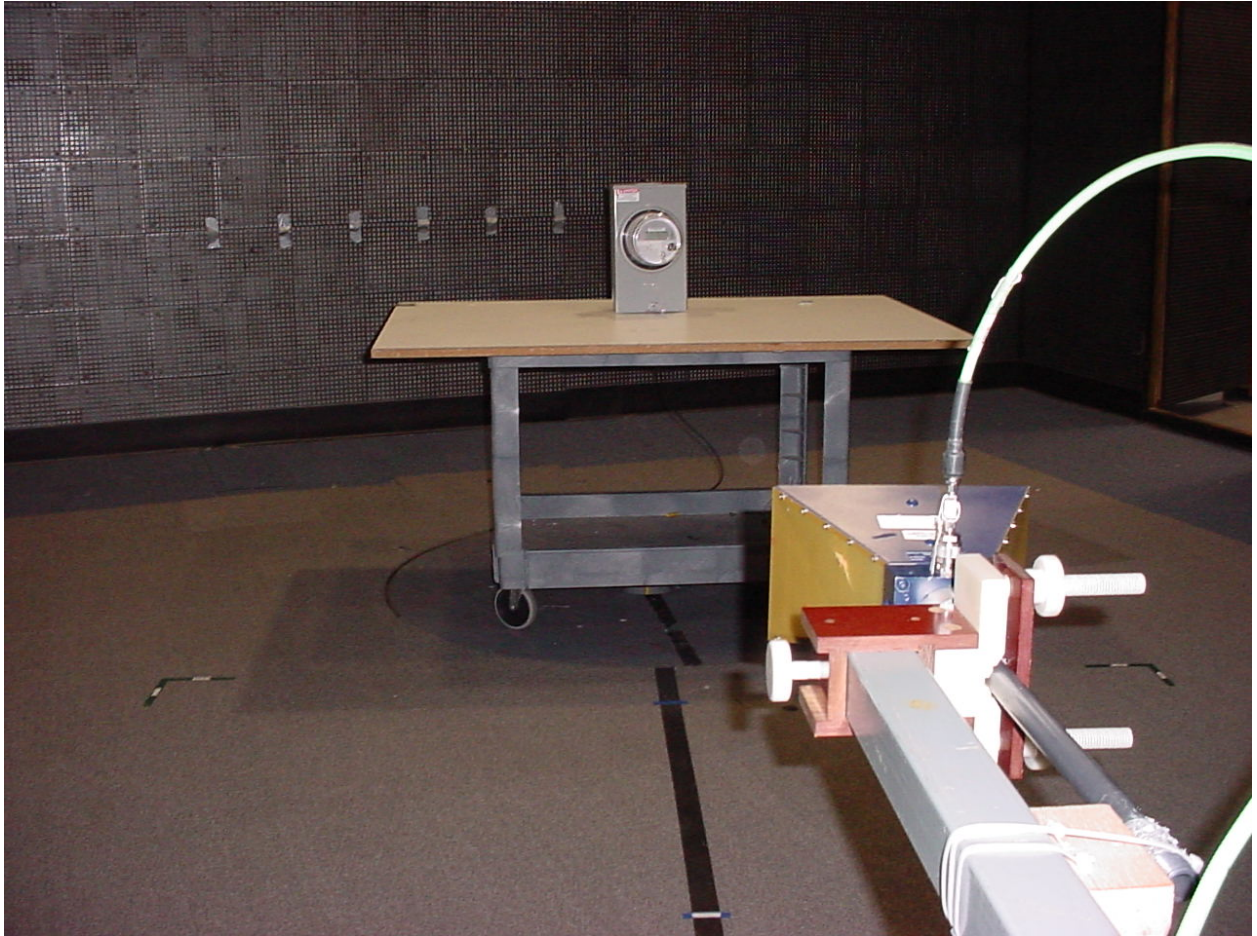
Figure 2: Test Setup – Radiated Emissions - Polyphase