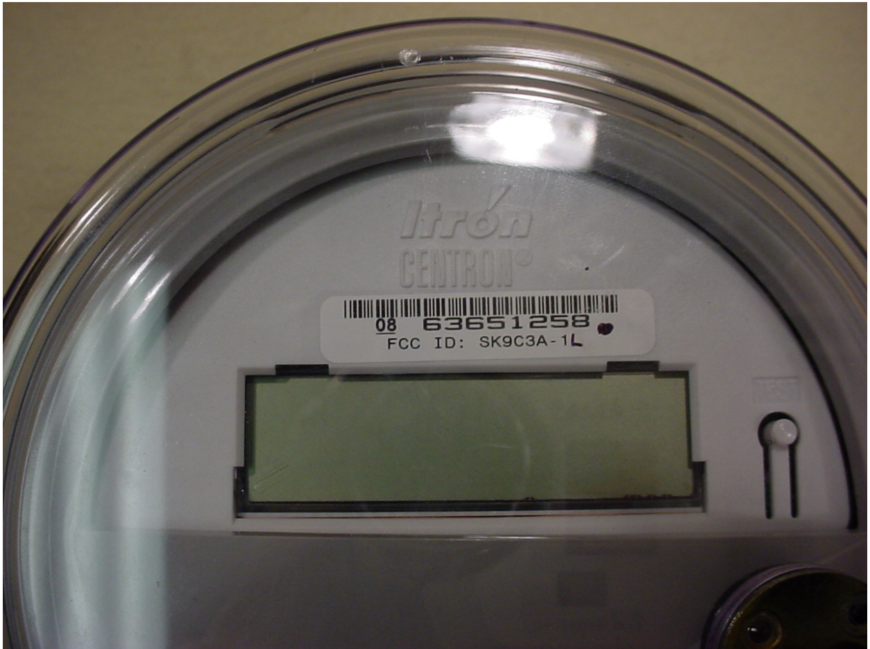
Figure 3: Label Placement – ID Numbers