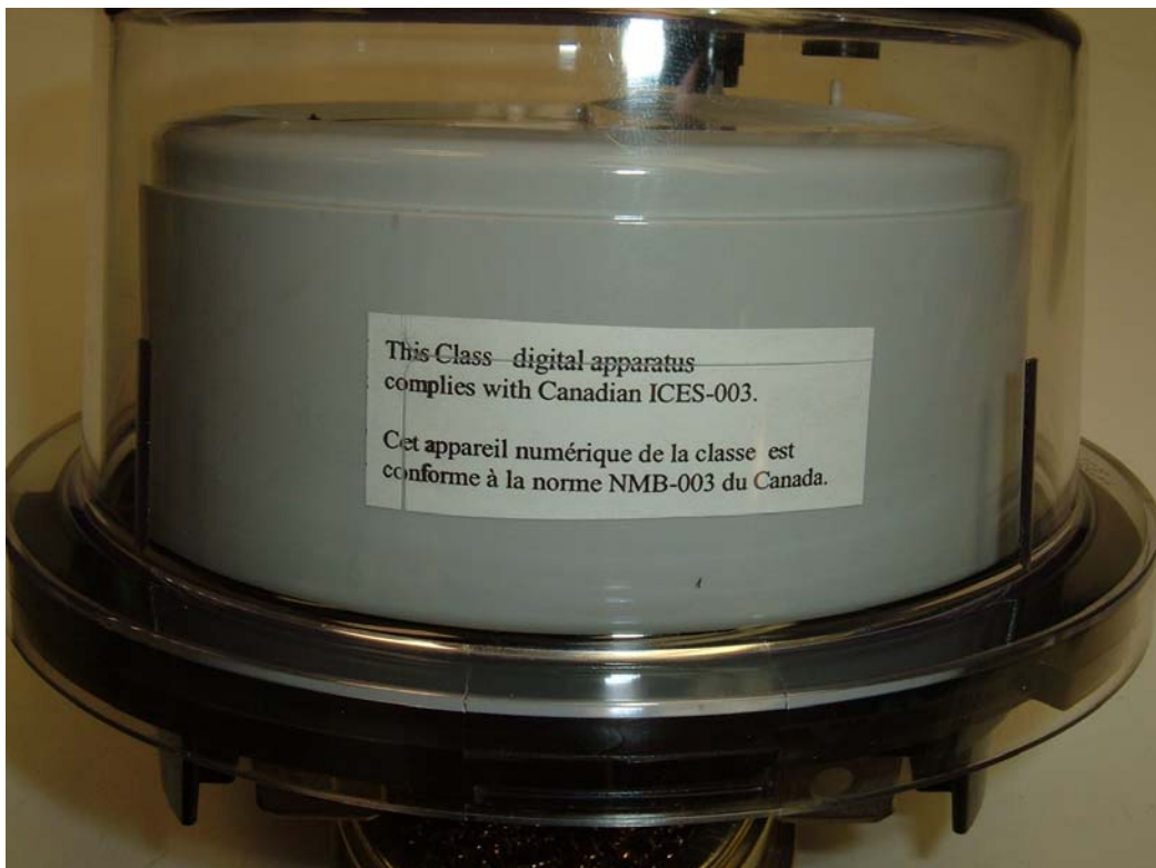
Figure 5: Label Placement – IC Compliance Statement