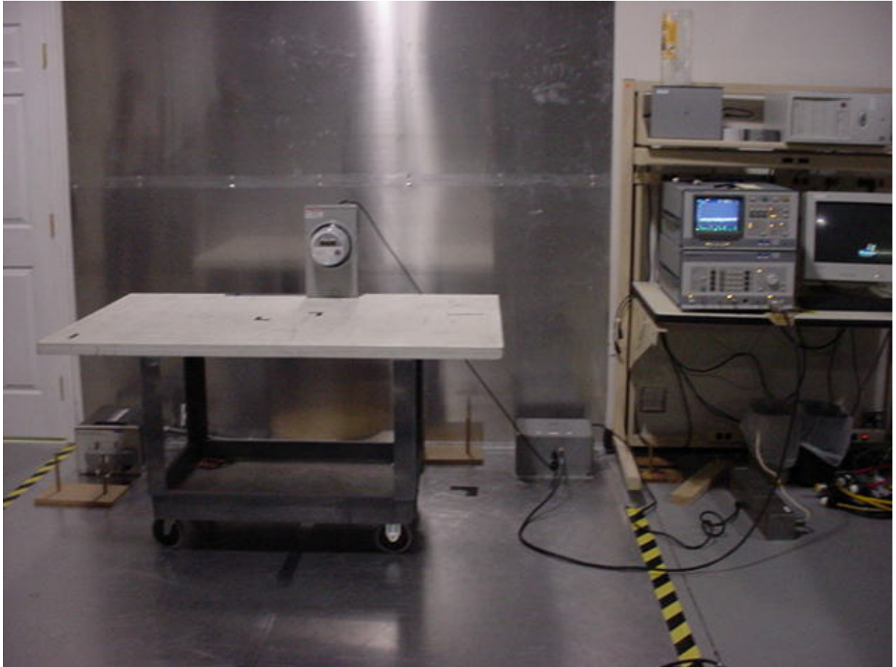
Figure 4: Test Setup – Conducted Emissions - Polyphase