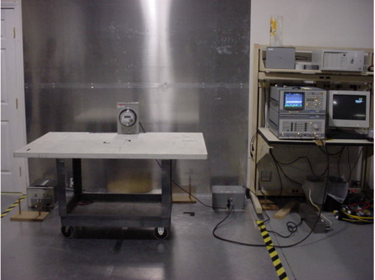
Figure 3: Test Setup – Conducted Emissions - Monophase