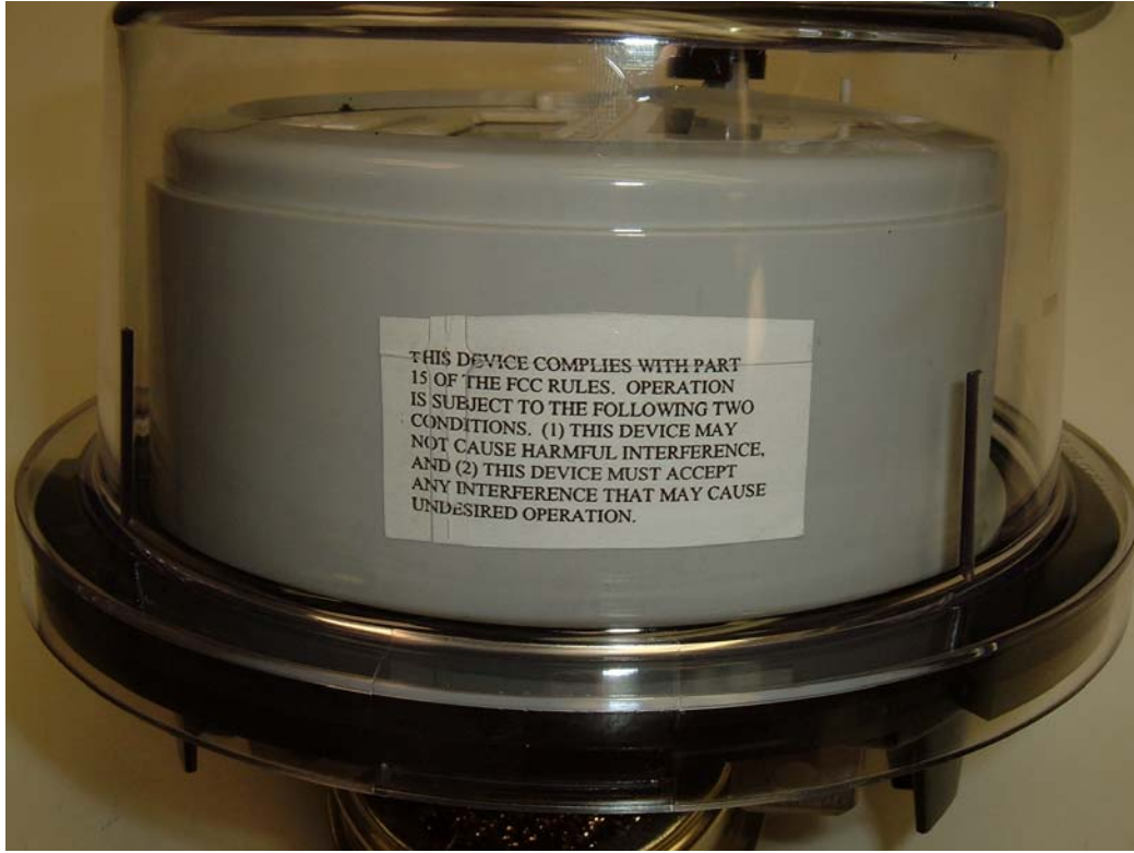
Figure 4: Label Placement – FCC Compliance Statement