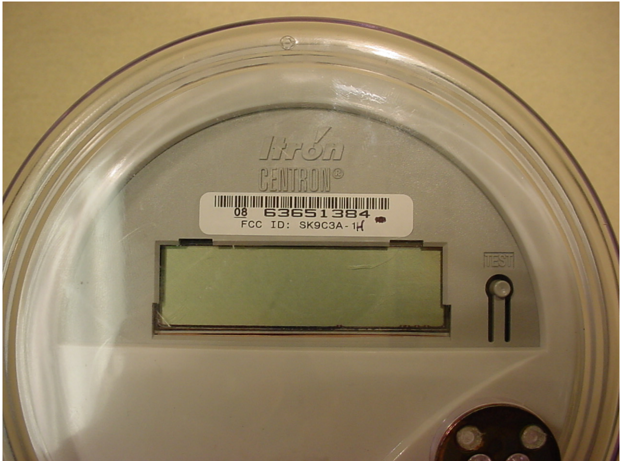
Figure 3: Label Placement – ID Numbers