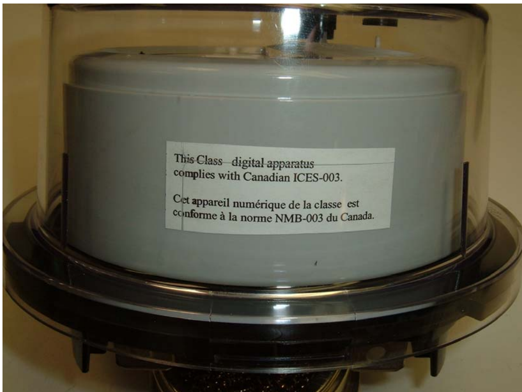
Figure 5: Label Placement – IC Compliance Statement