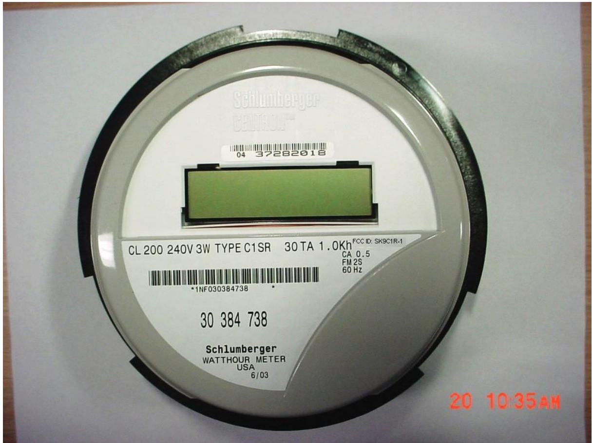
Figure 1: Front View