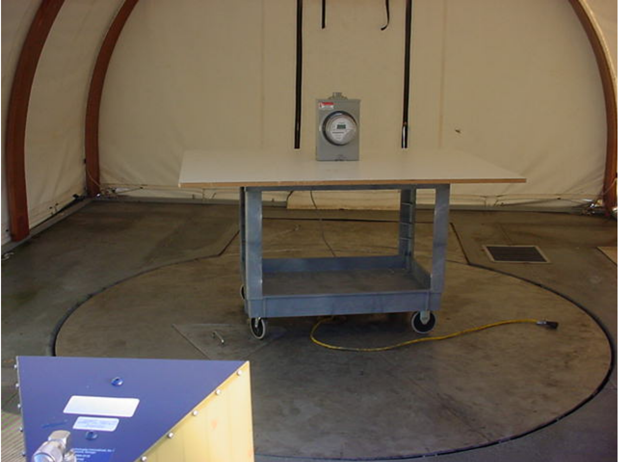
Figure 2: Radiated Emissions – Front View