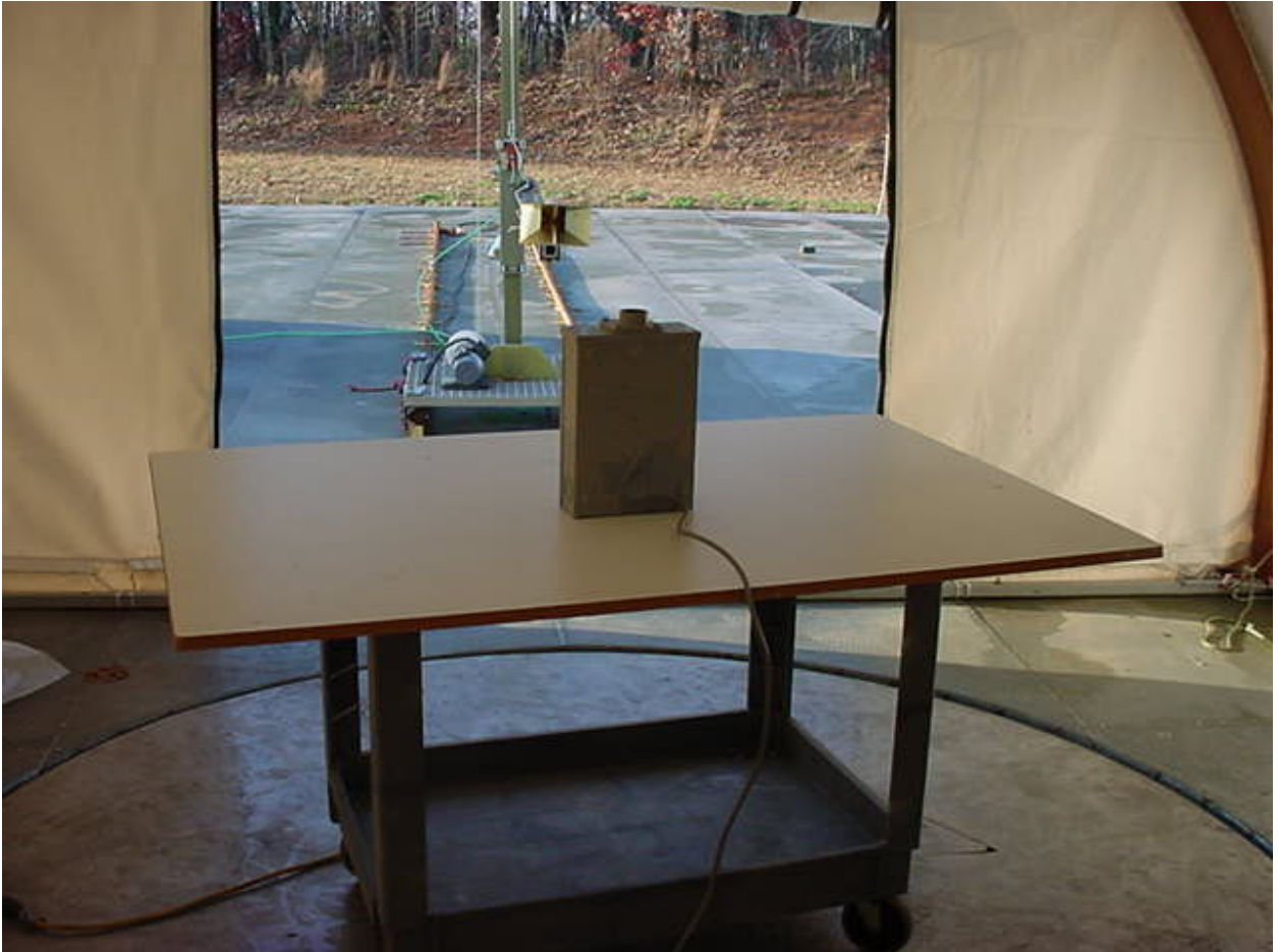
Figure 1: Radiated Emissions – Rear View