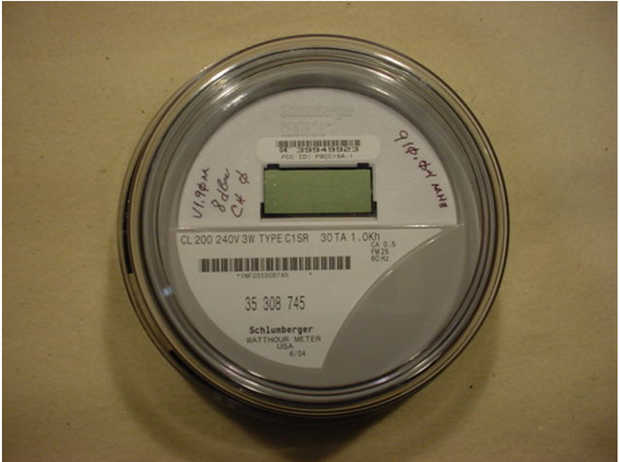
Figure 2: Front View