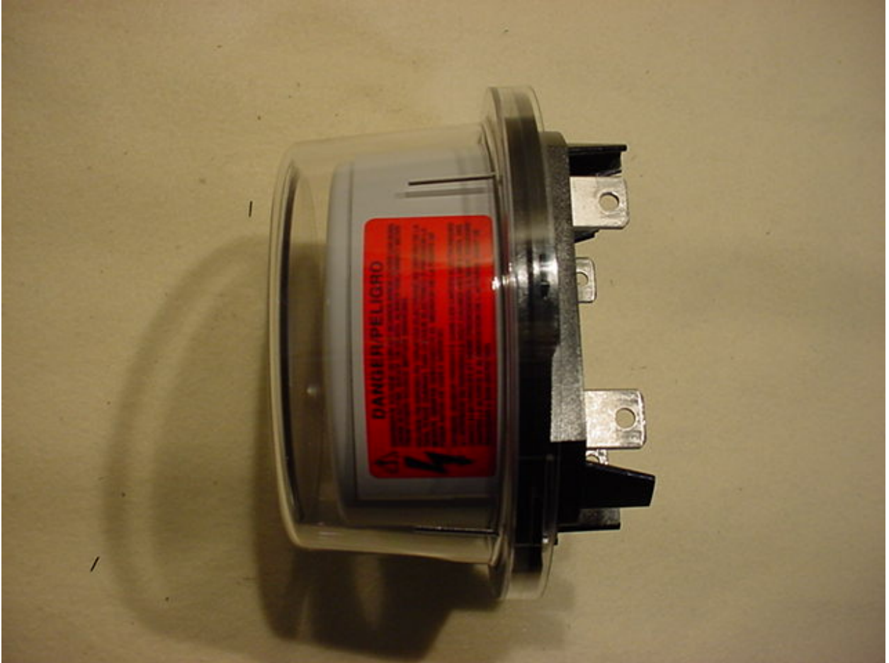
Figure 4: Side View