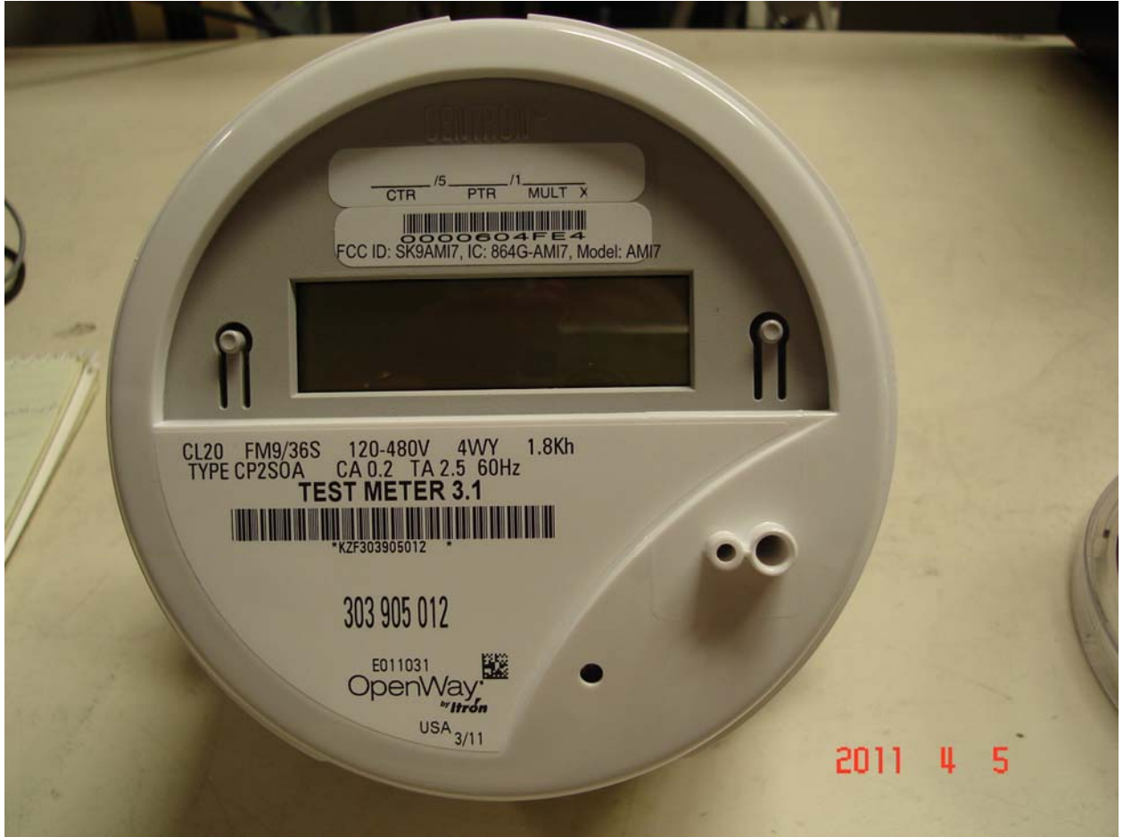
Figure 2: Itron AMI7 module installed in meter

313 North Highway 11 West Union, SC 29696 864.638.8300 Tel 864.638.4848 Fax www.itron.com