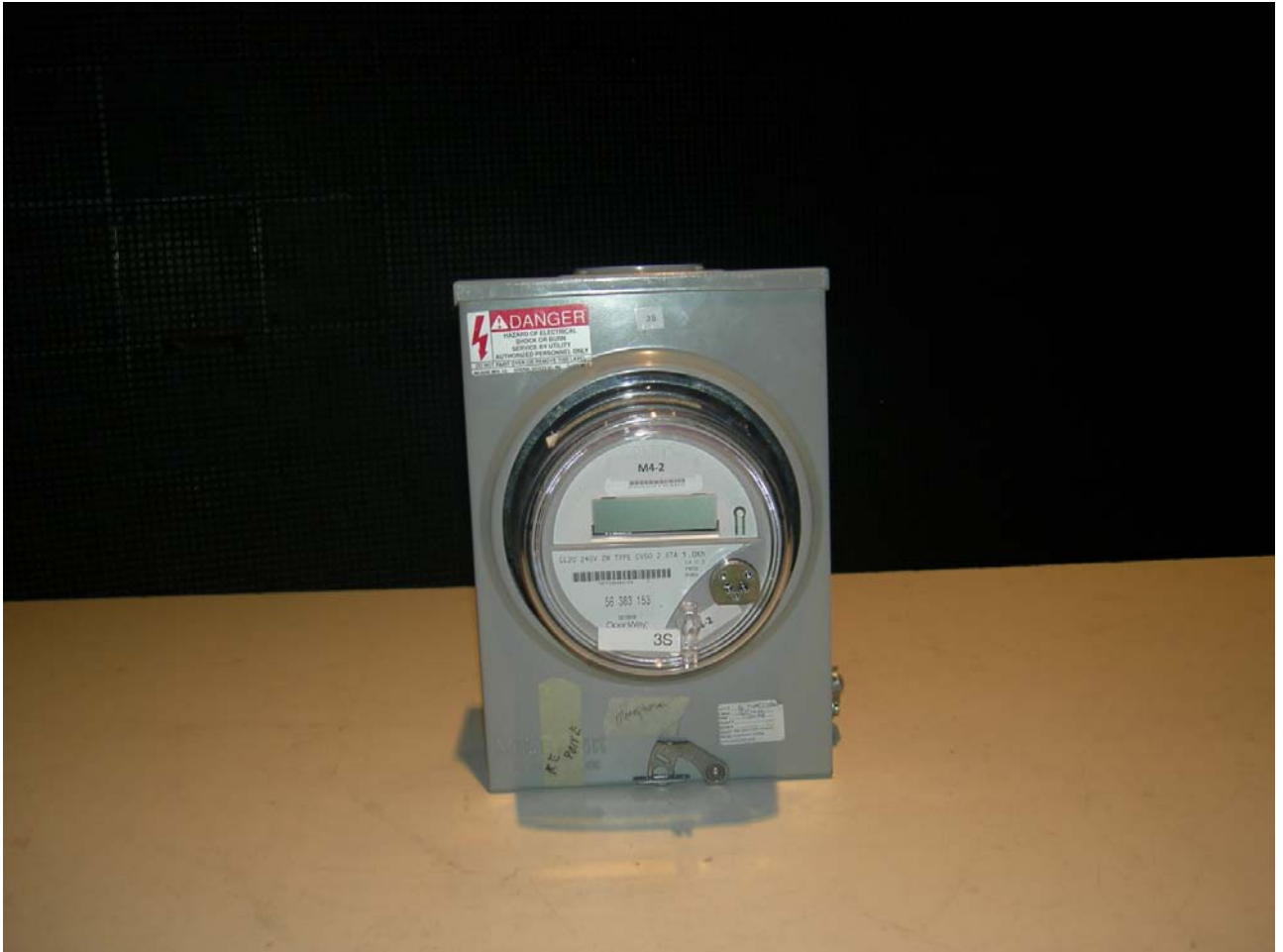
Figure 3: Radiated Emissions, 3S Meter