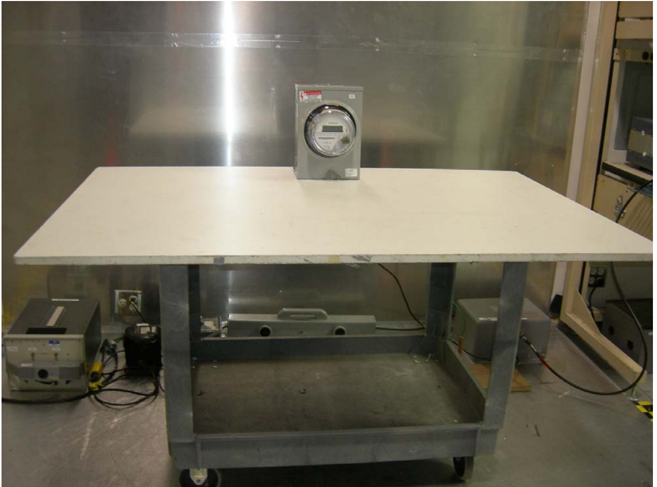
Figure 8: Conducted Emisions