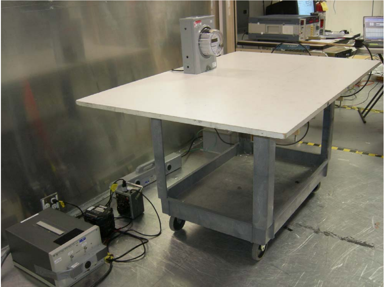
Figure 9: Conducted Emissions