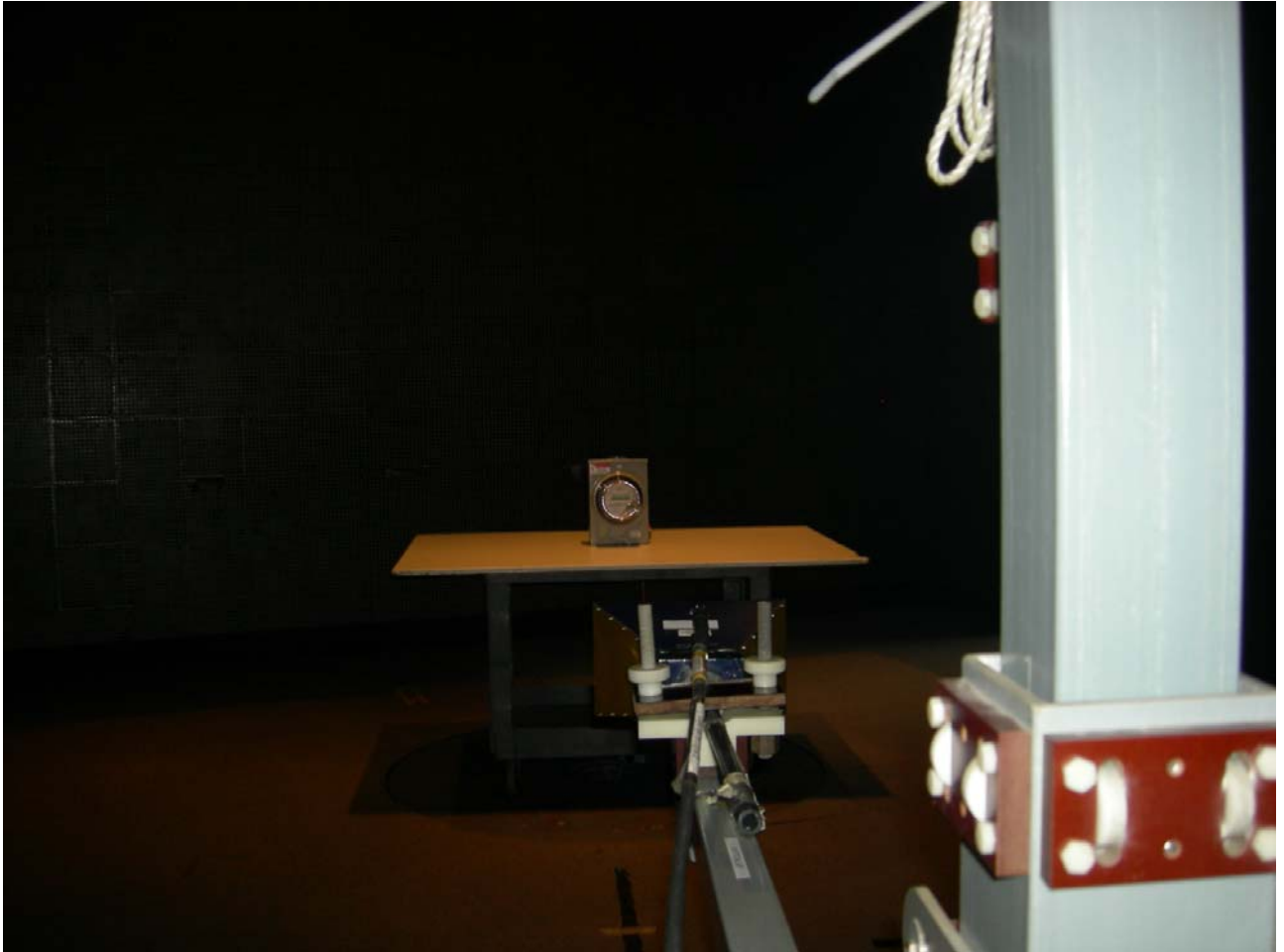
Figure 2: Radiated Emissions, 3S Meter