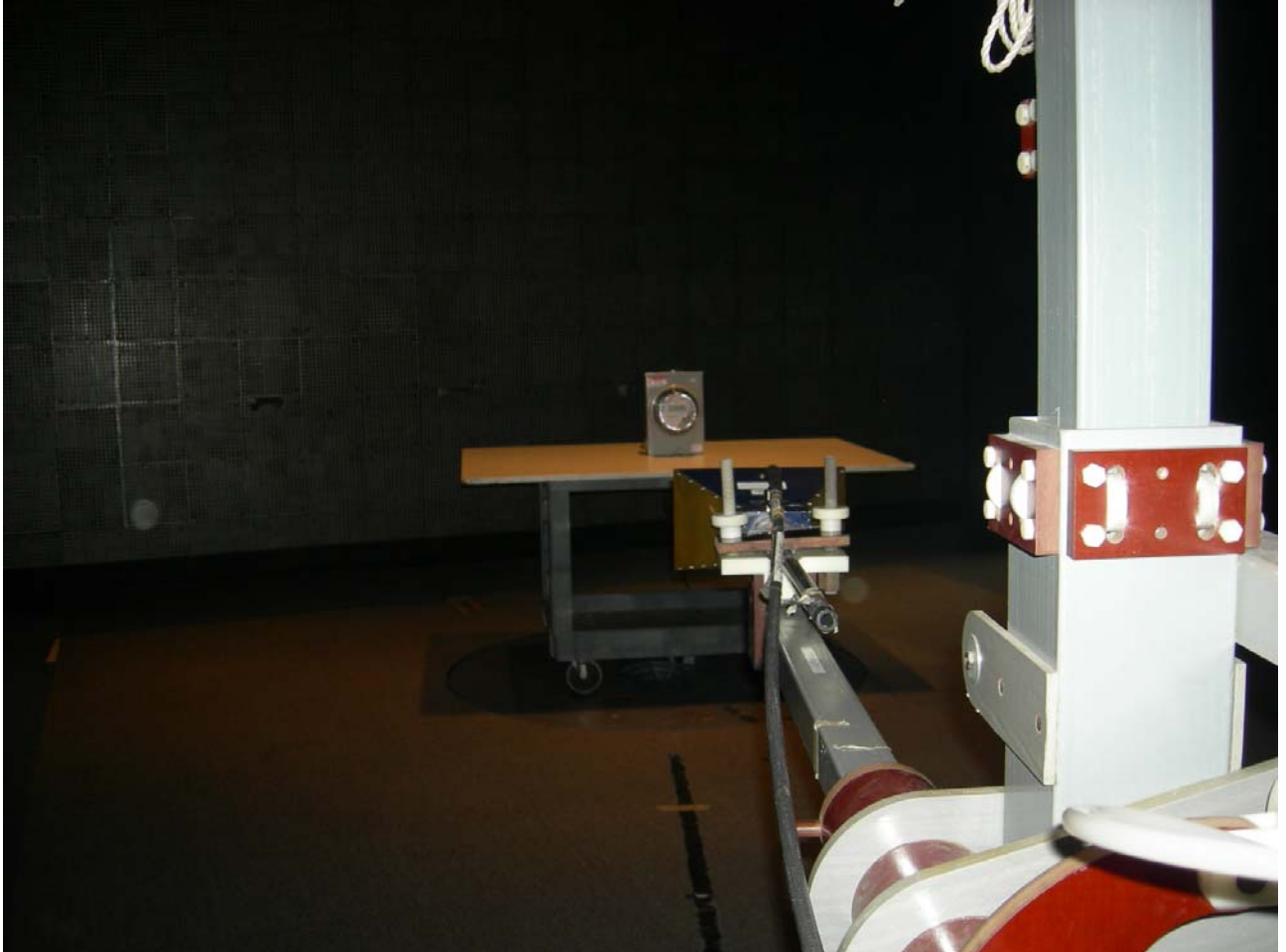
Figure 5: Radiated Emissions, 4S Meter