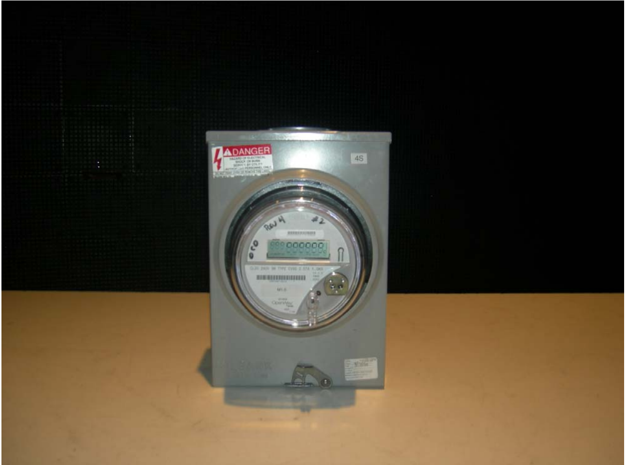
Figure 6: Radiated Emissions, 4S Meter