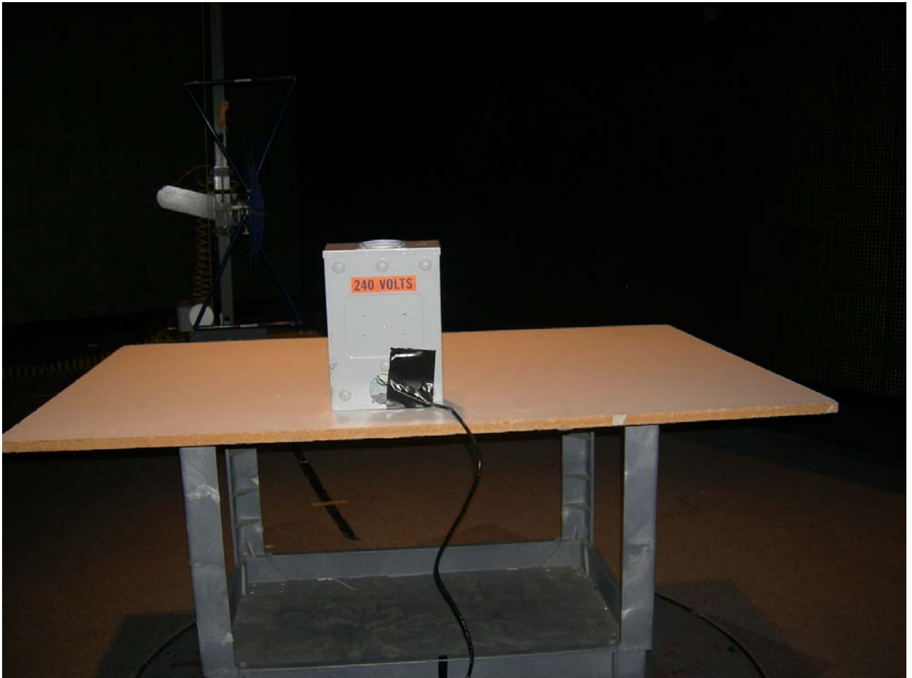
Figure 7: Unintentional Emissions