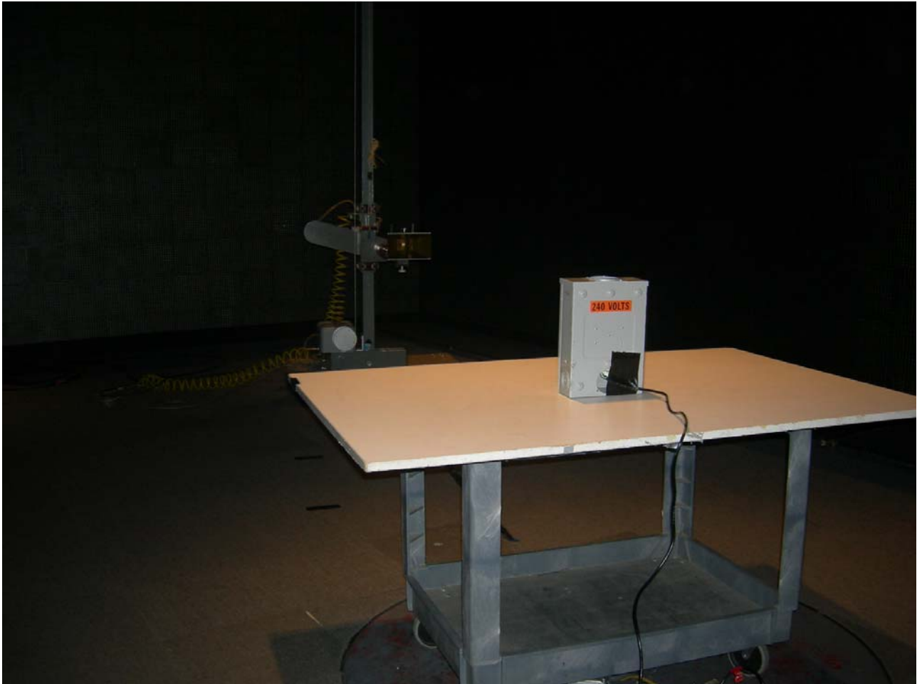
Figure 4: Radiated Emissions, 4S Meter