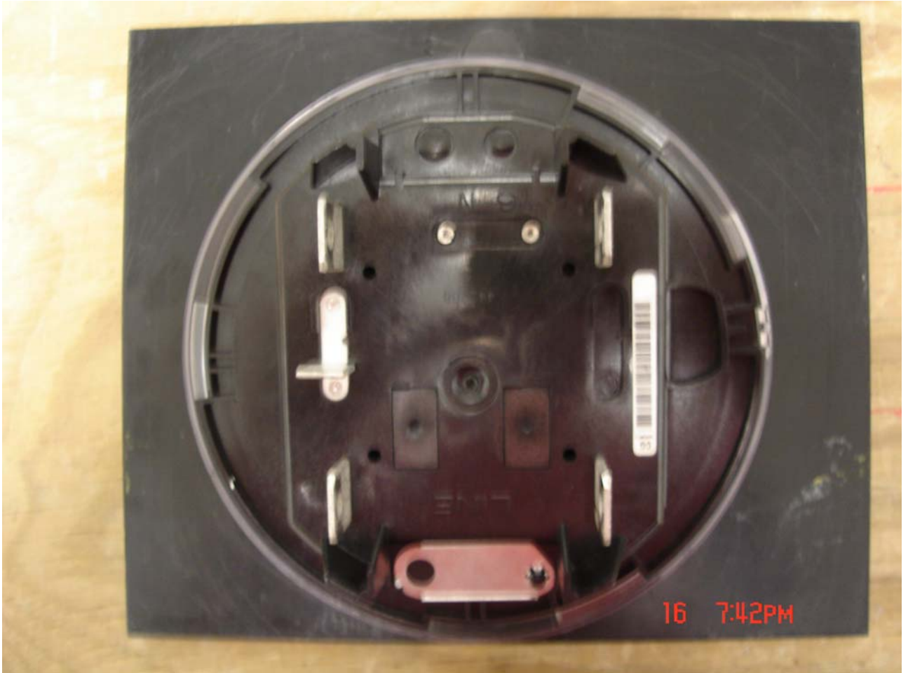
Figure 3: 3S Bottom View