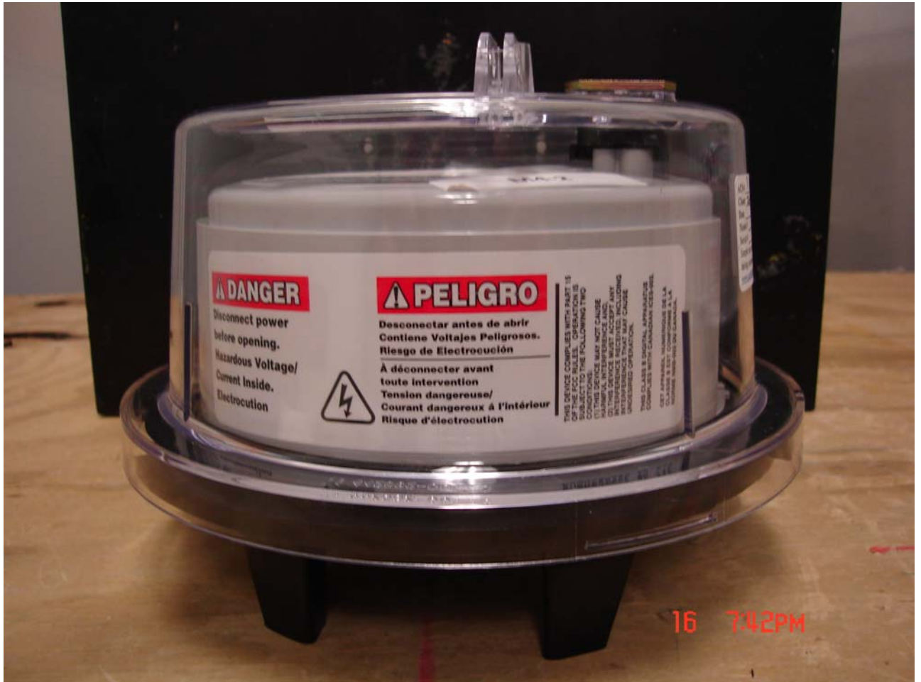
Figure 2: Side View