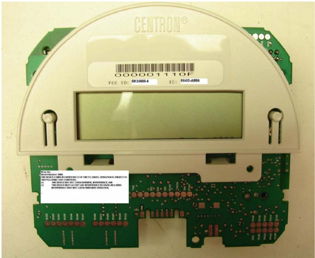
Figure 3: Label Locations