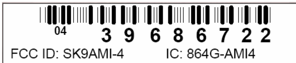
Figure 1: Sample Label - Identifiers (Visible from Host Exterior)