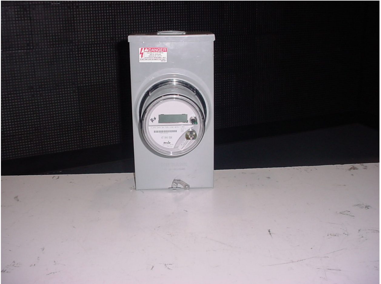
Figure 1: Radiated Emissions