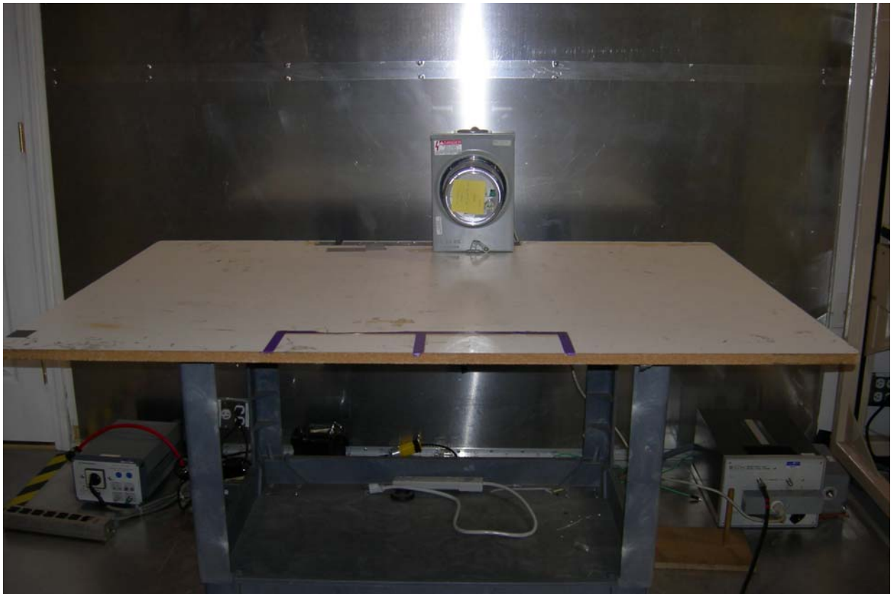
Figure 3: AC Power Line Conducted Emissions