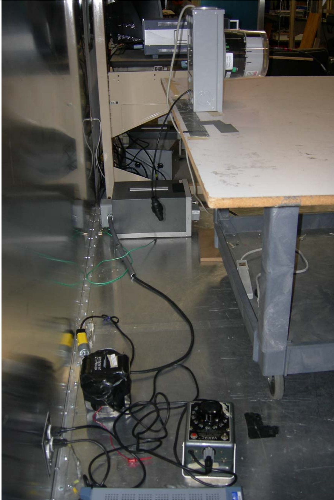
Figure 4: AC Power Line Conducted Emissions