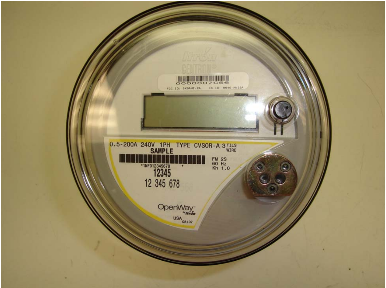
Figure 1: External – Top View