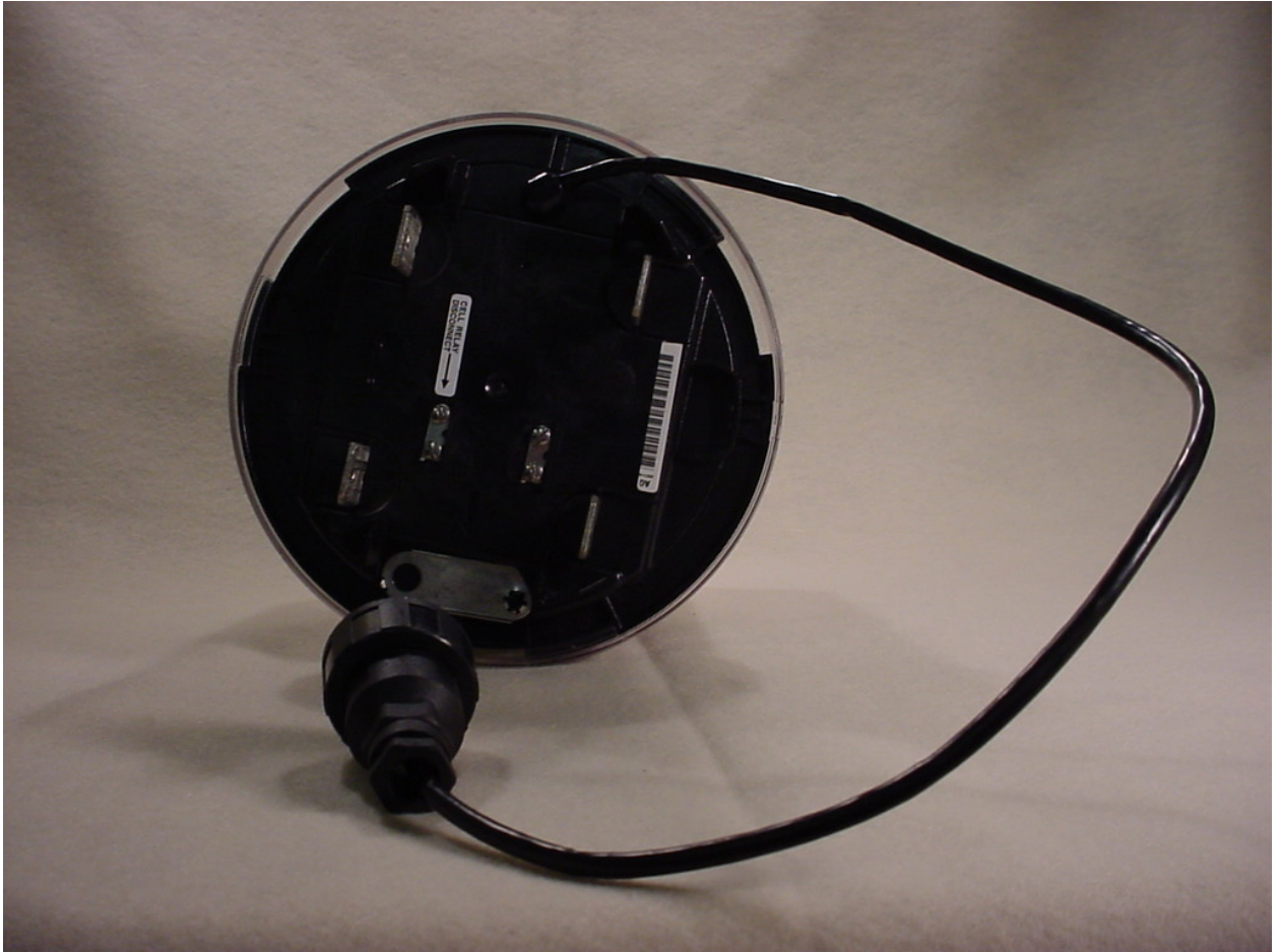
Figure 4: External – Bottom View