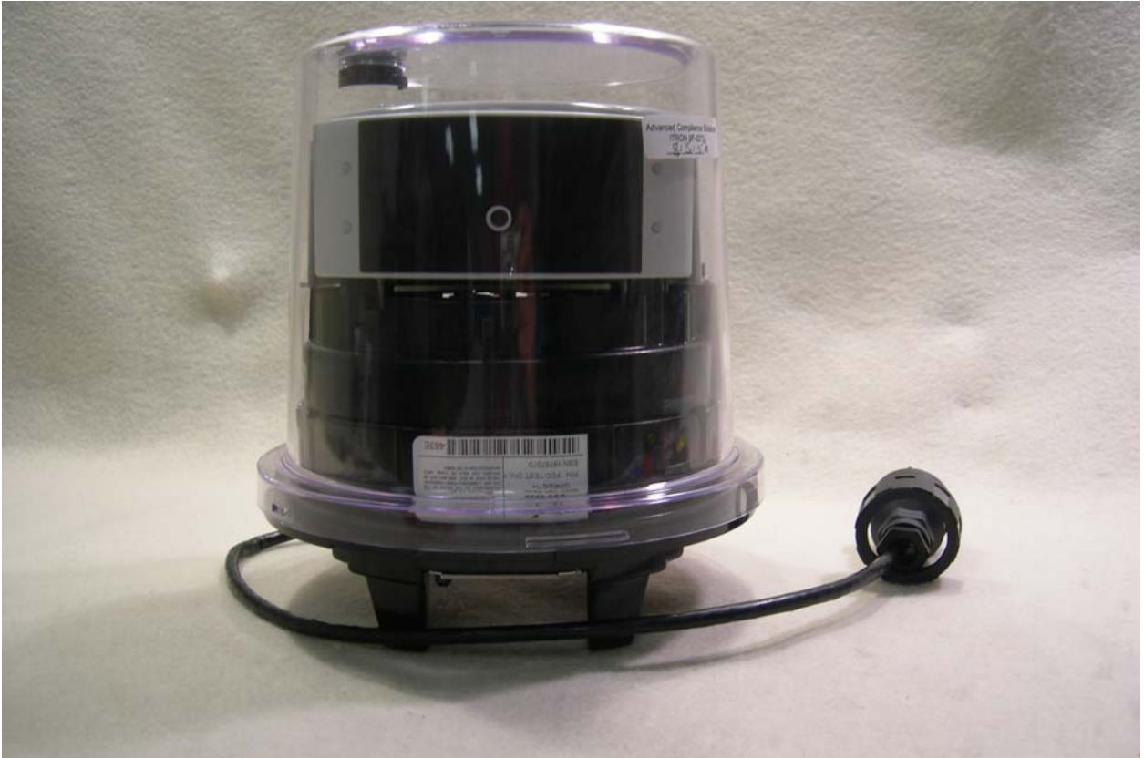
Figure 3: External – Side View