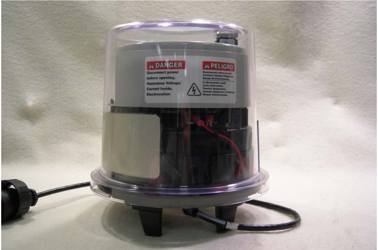
Figure 2: External – Side View