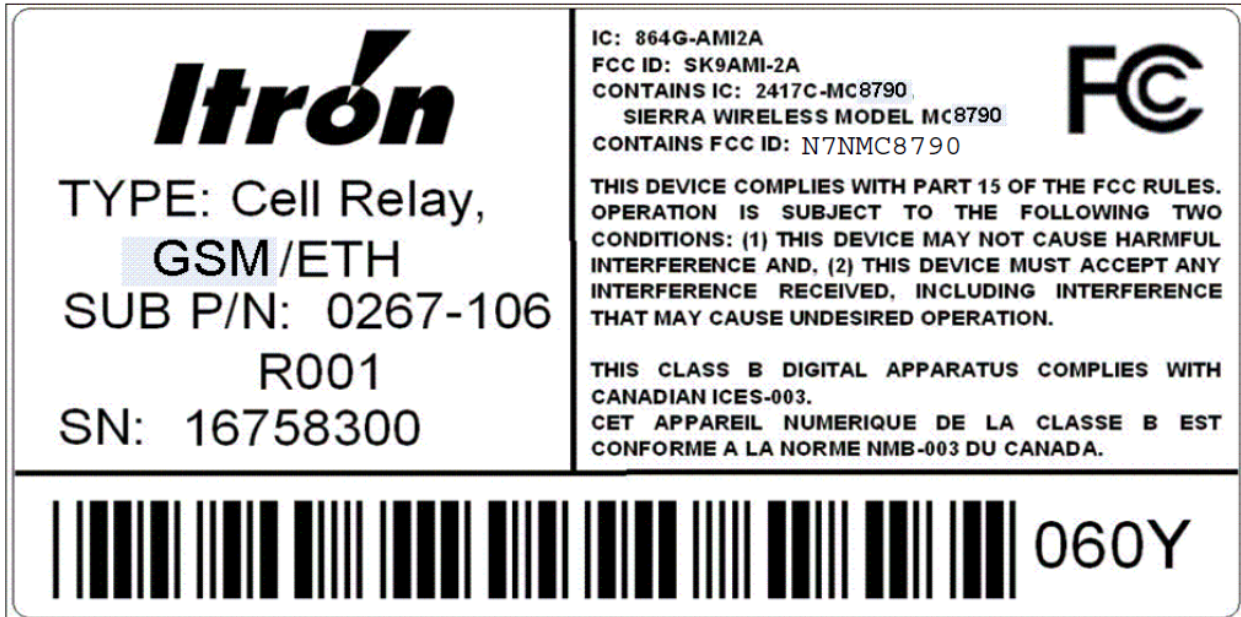
Figure 1: Sample Label – ID Label