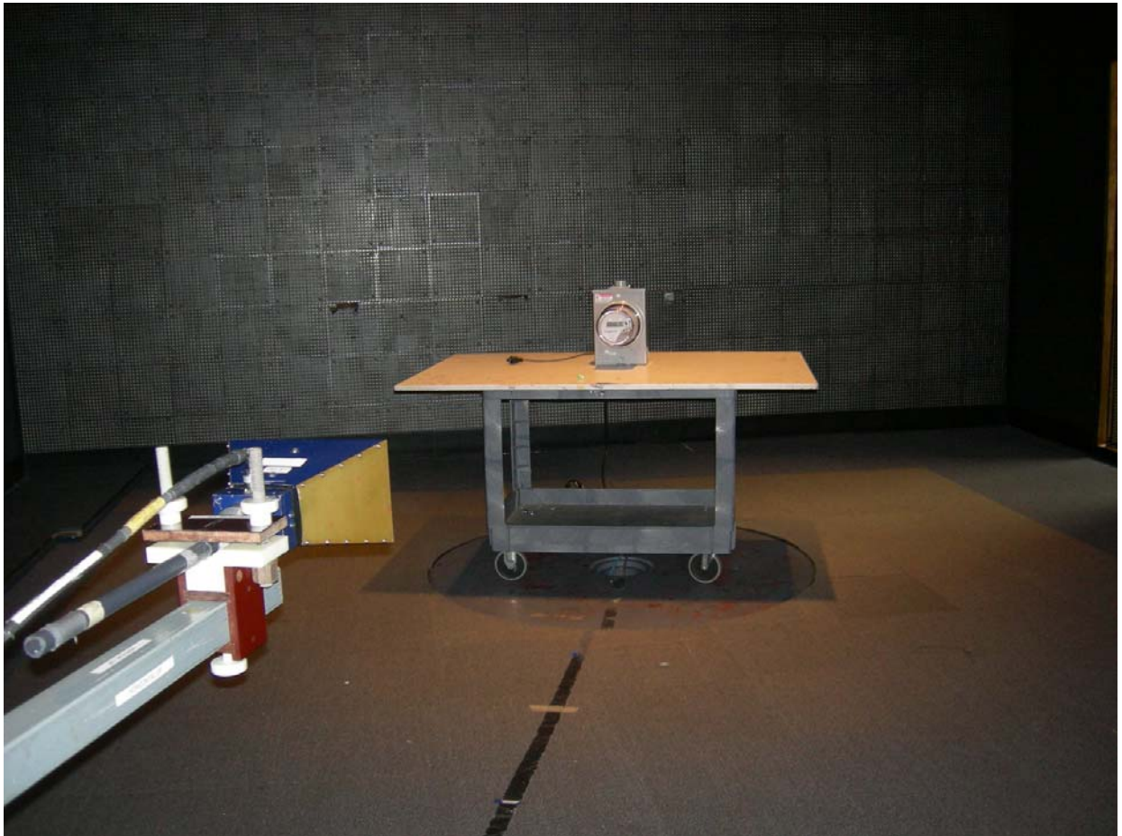
Figure 1: Radiated Emissions