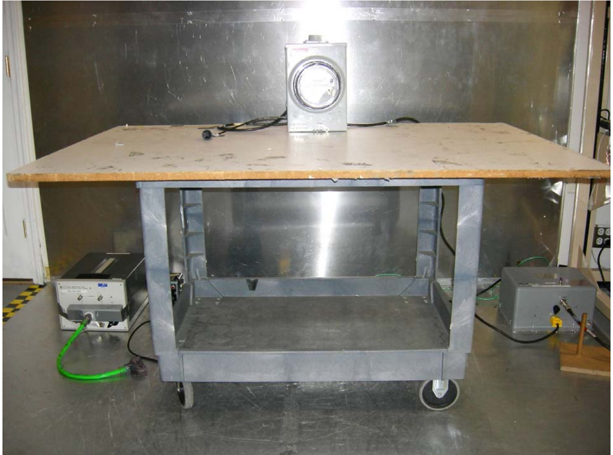
Figure 3: AC Power Line Conducted Emissions