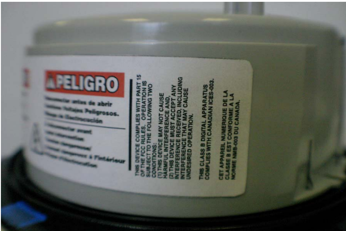
Figure 5: Sample Label – 2 Part Warning Statement