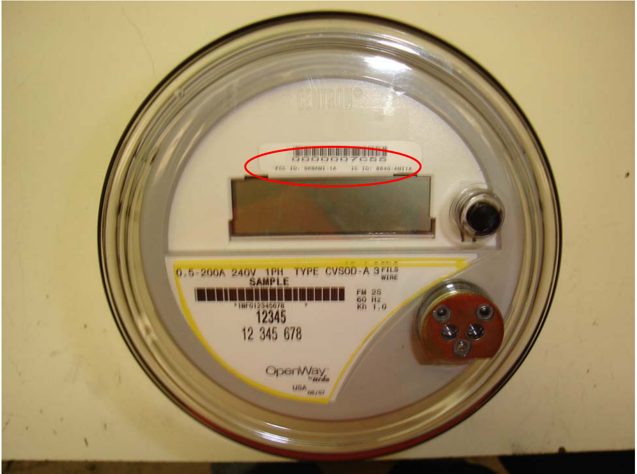
Figure 3: Sample Label – ID Label Location – CVSOD-A