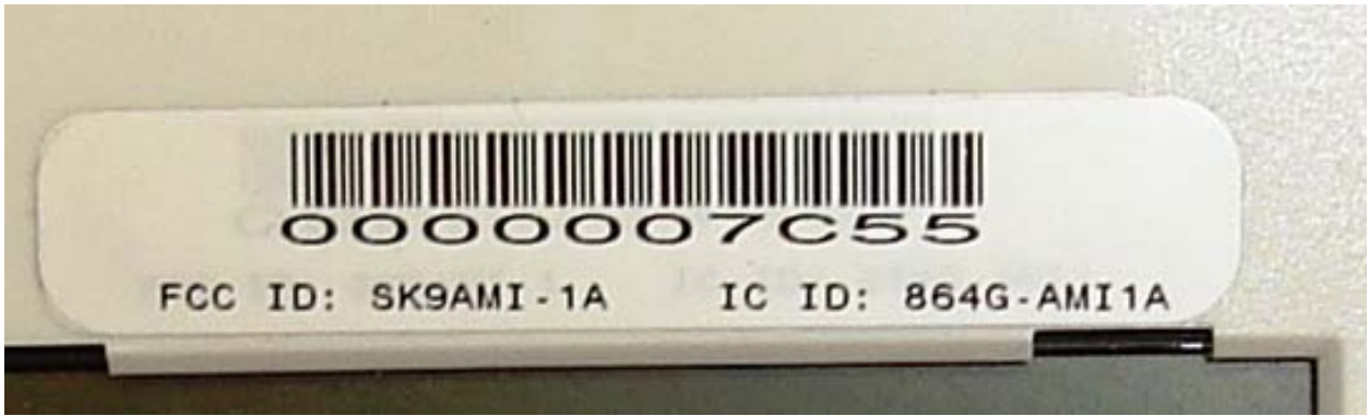
Figure 1: Sample Label – ID Label– CVSO-A