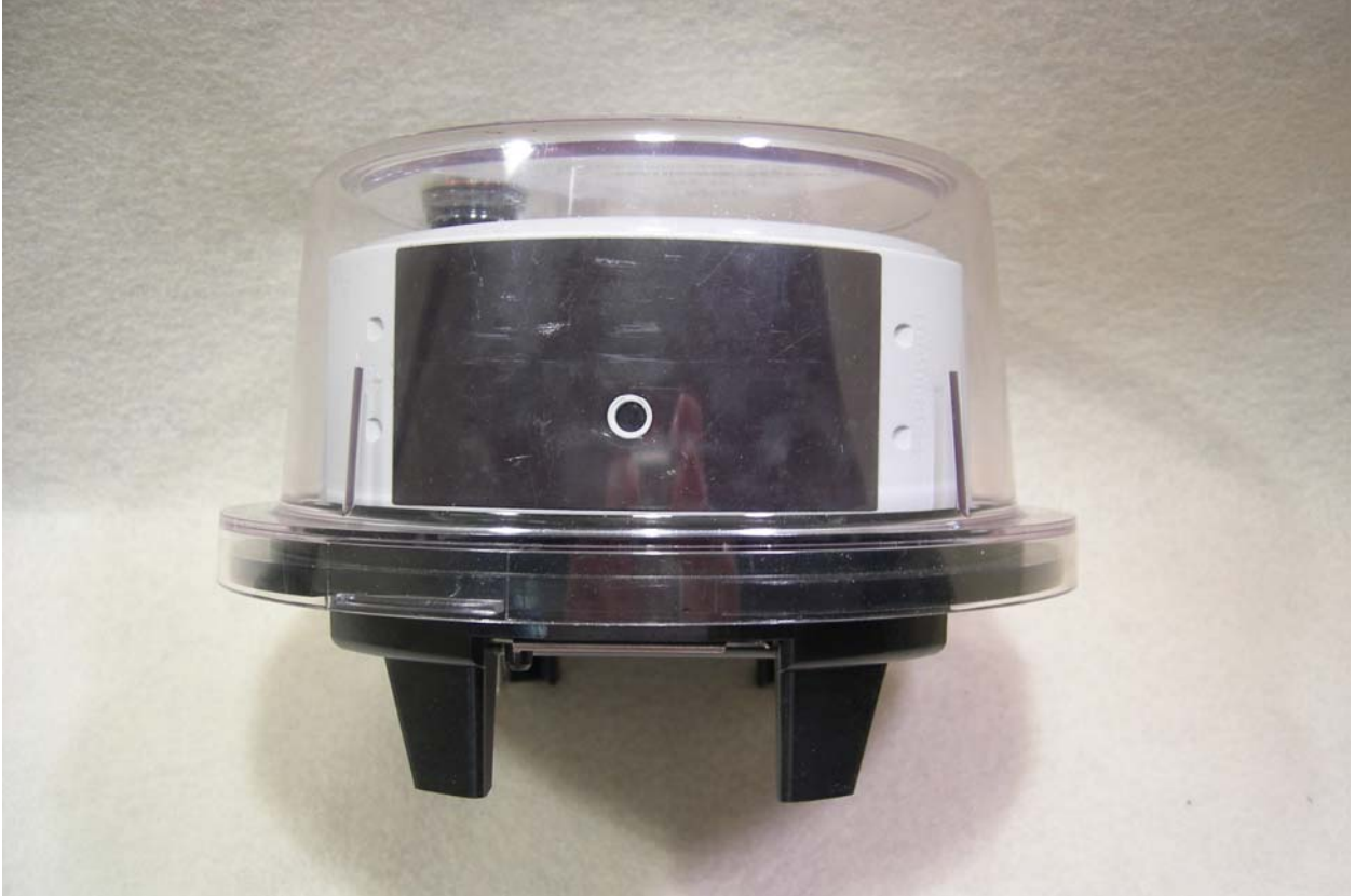
Figure 2: External – Side View