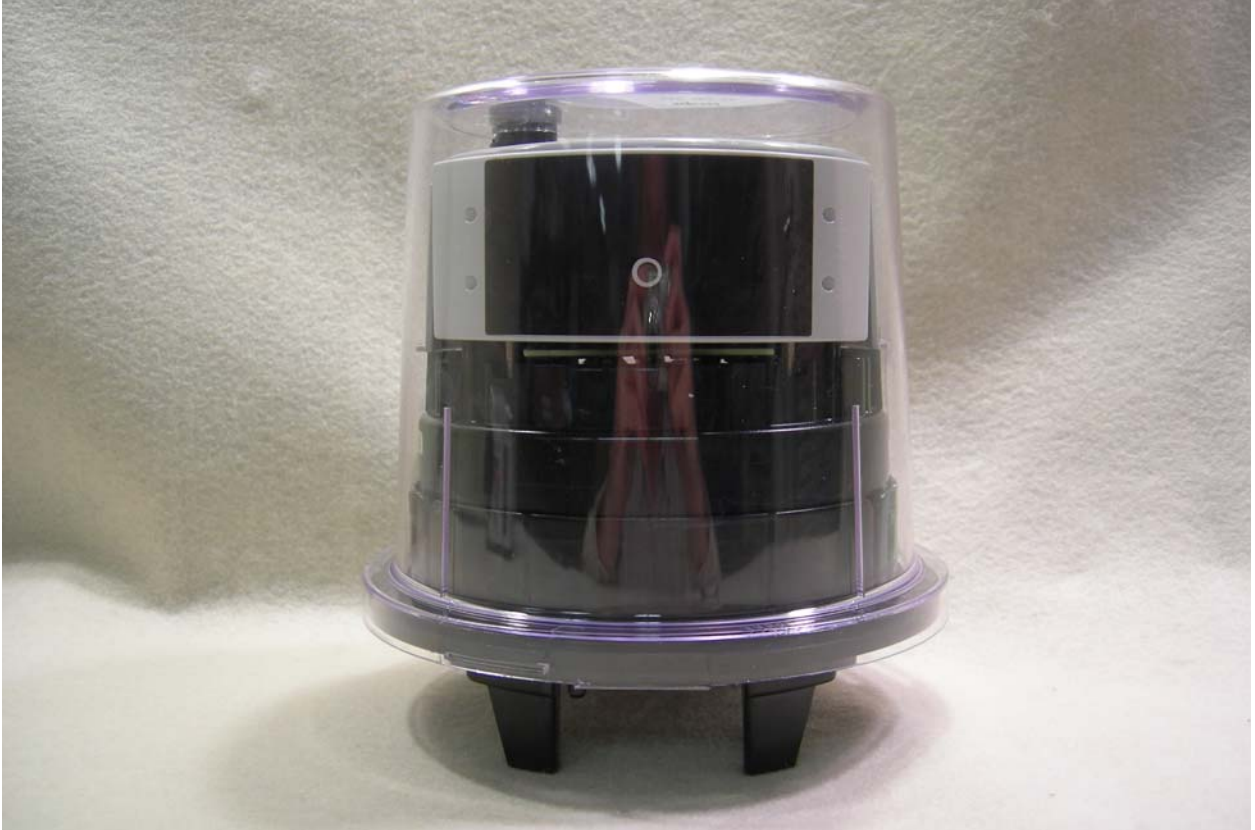
Figure 6: External – Side View