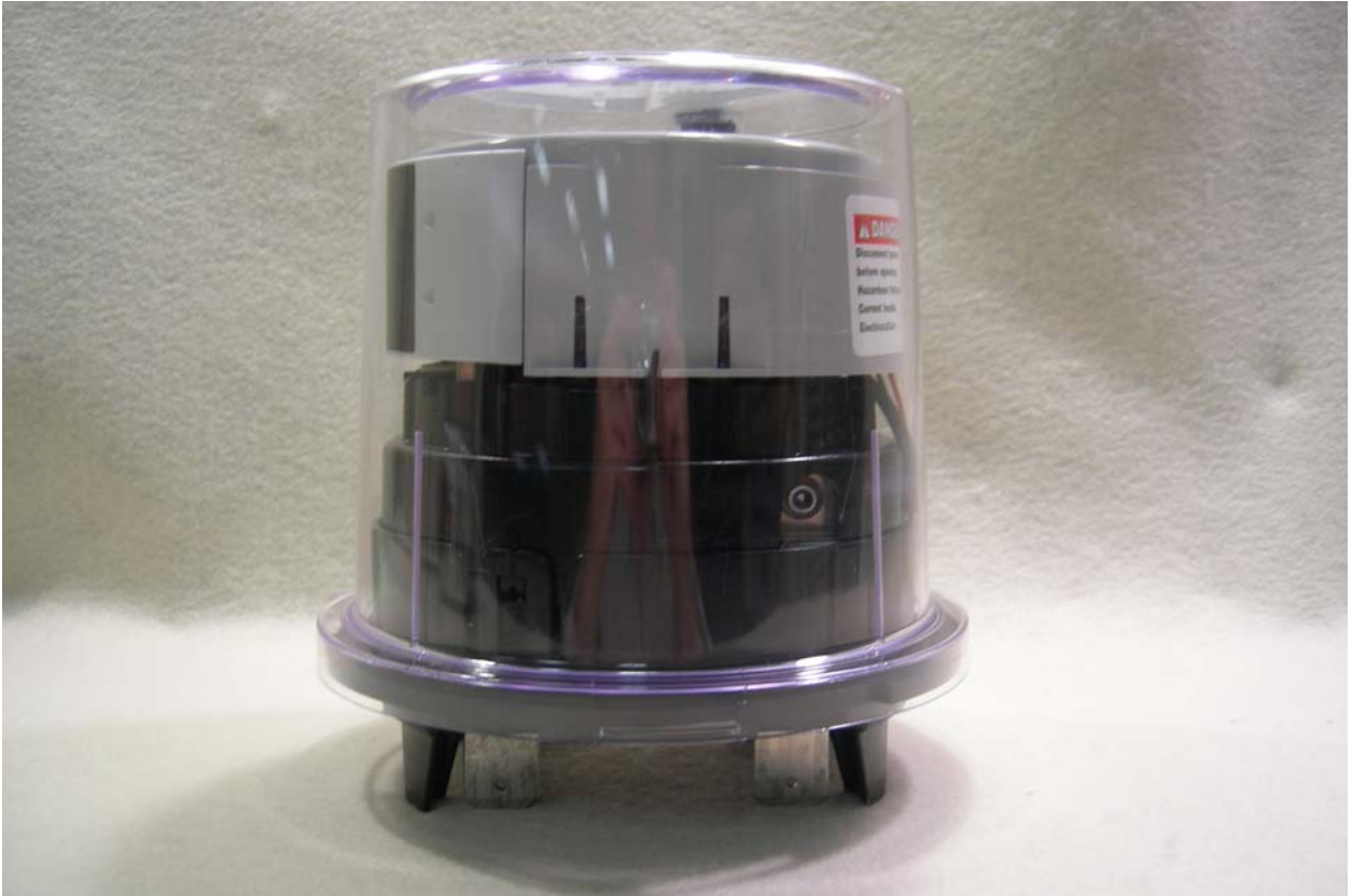
Figure 7: External – Side View