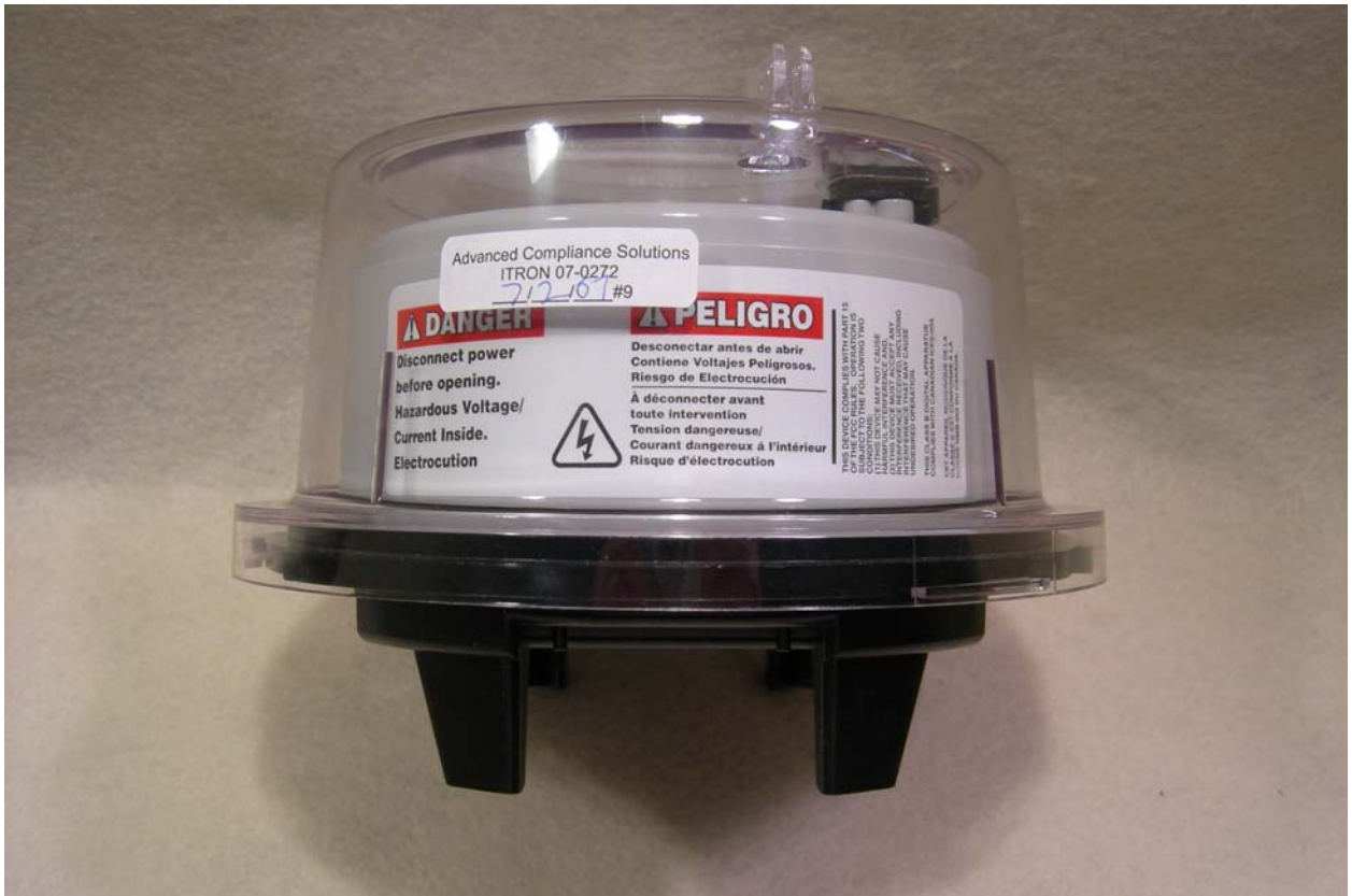
Figure 3: External – Side View