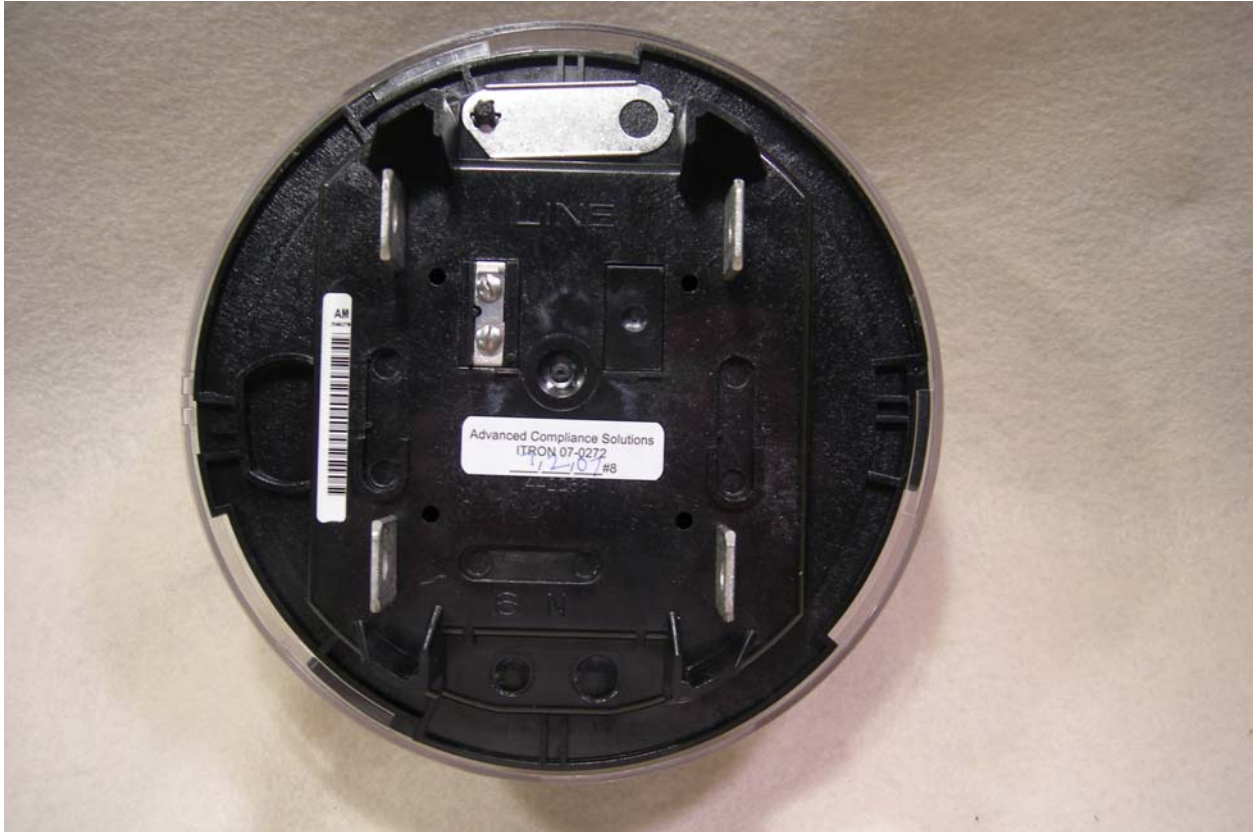
Figure 4: External – Bottom View