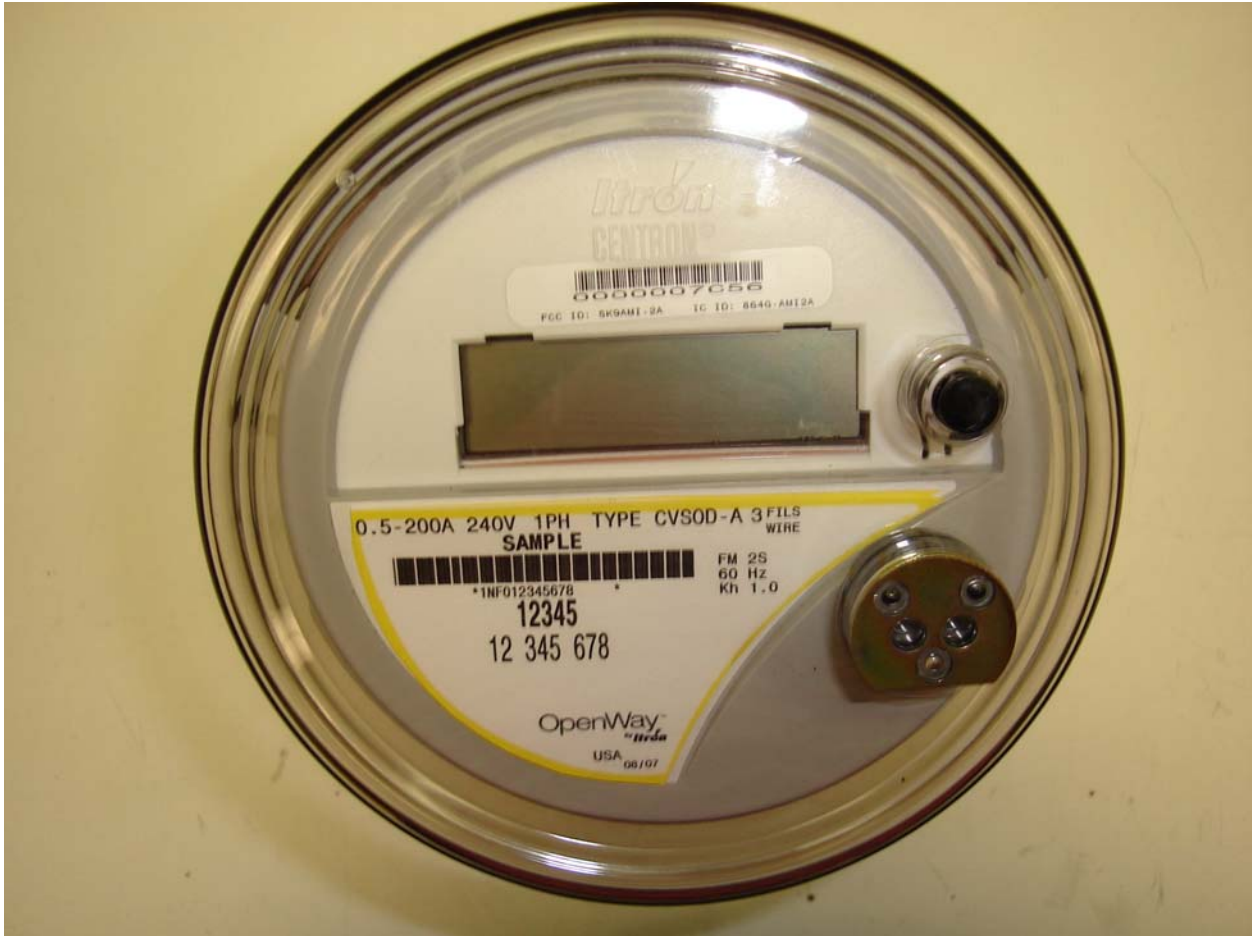
Figure 5: External – Top View