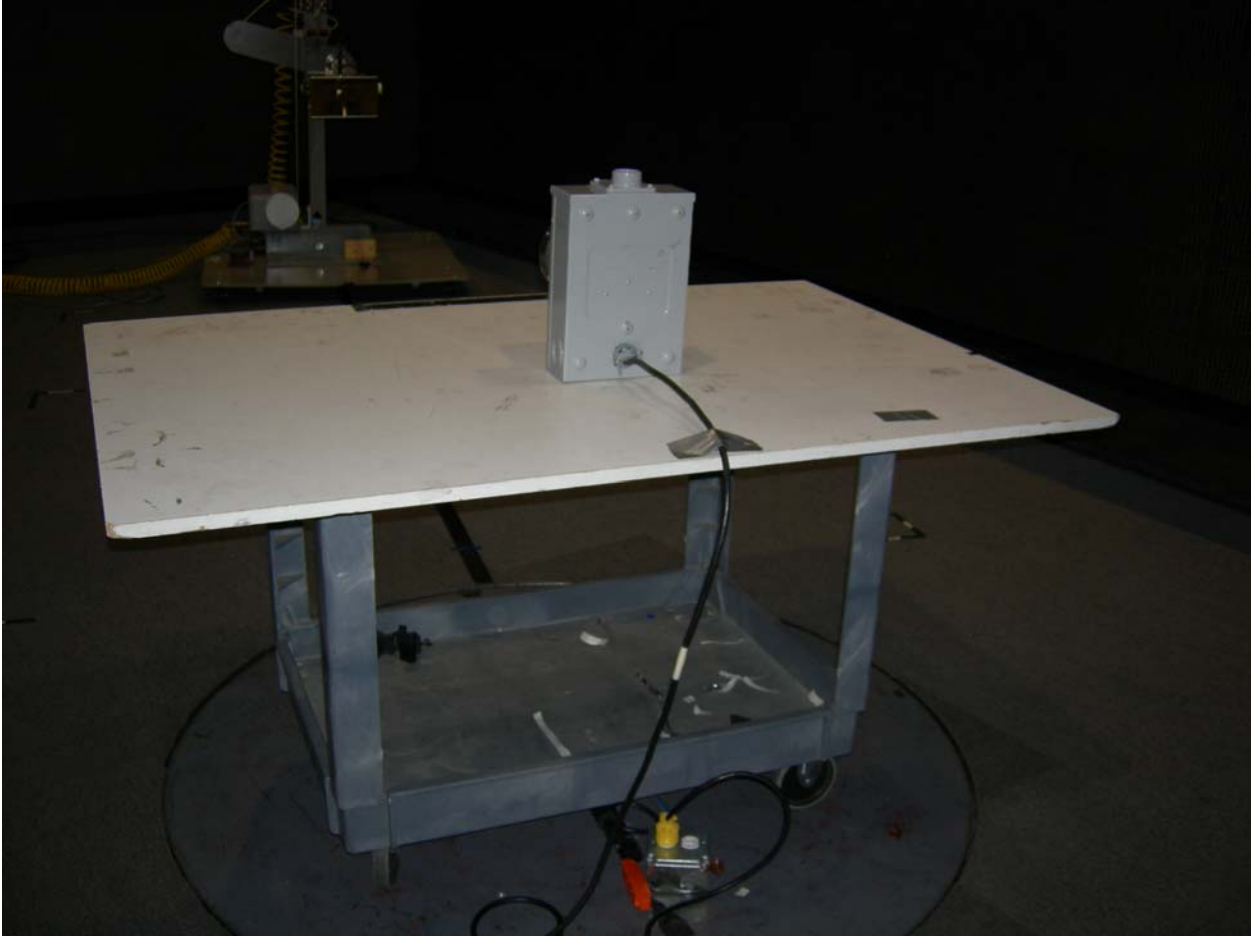
Figure 2: Test Setup – Radiated Emissions - Intentional