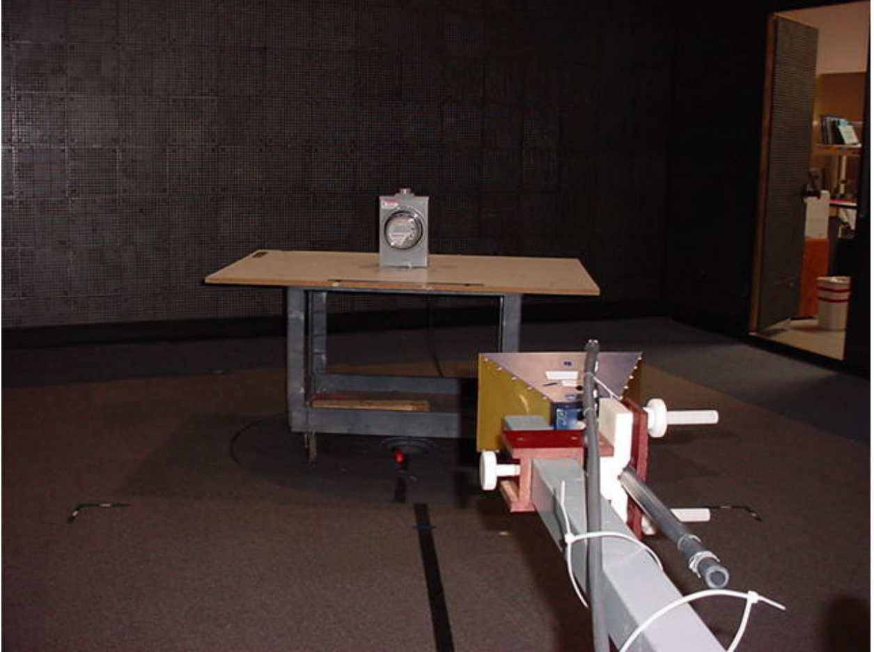
Figure 8: Test Setup – Radiated Emissions - Intentional