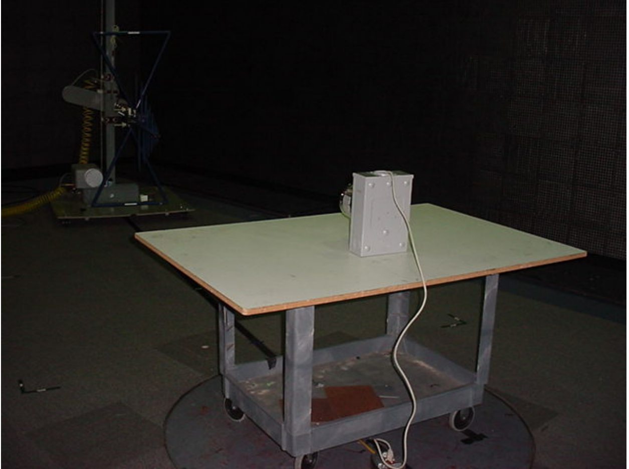
Figure 11: Test Setup – Radiated Emissions – Unintentional