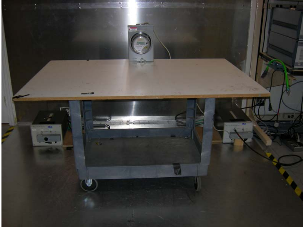
Figure 13: Test Setup – AC Power Line Conducted Emissions