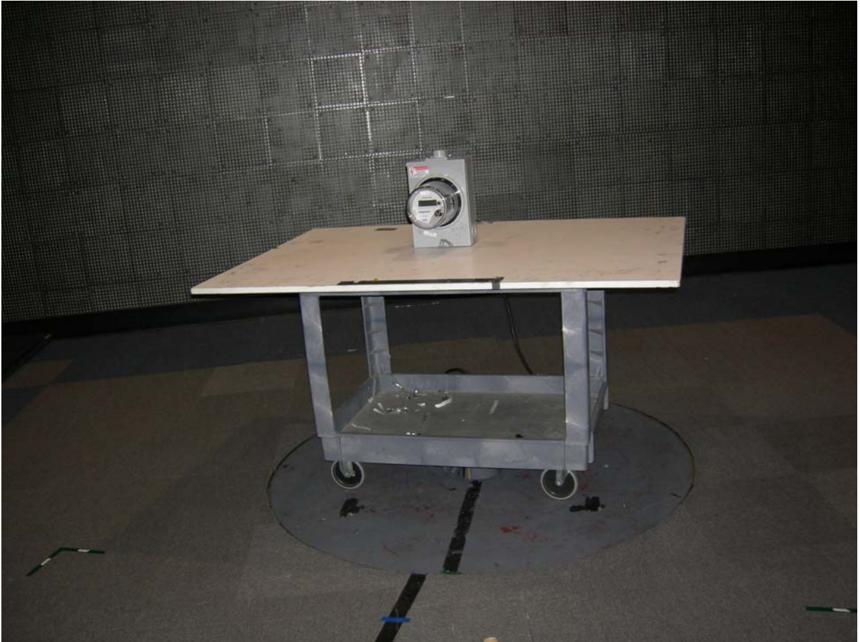
Figure 1: Test Setup – Radiated Emissions - Intentional