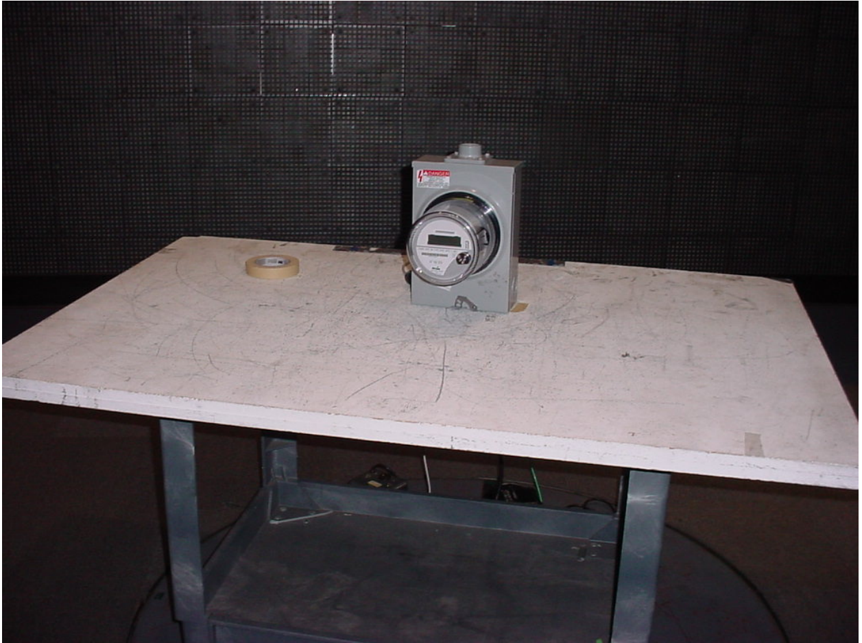
Figure 10: Test Setup – Radiated Emissions - Unintentional