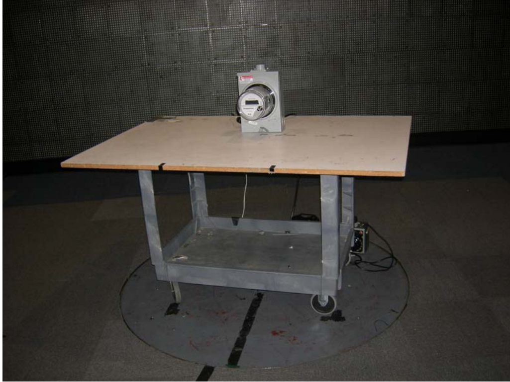
Figure 7: Test Setup – Radiated Emissions - Intentional