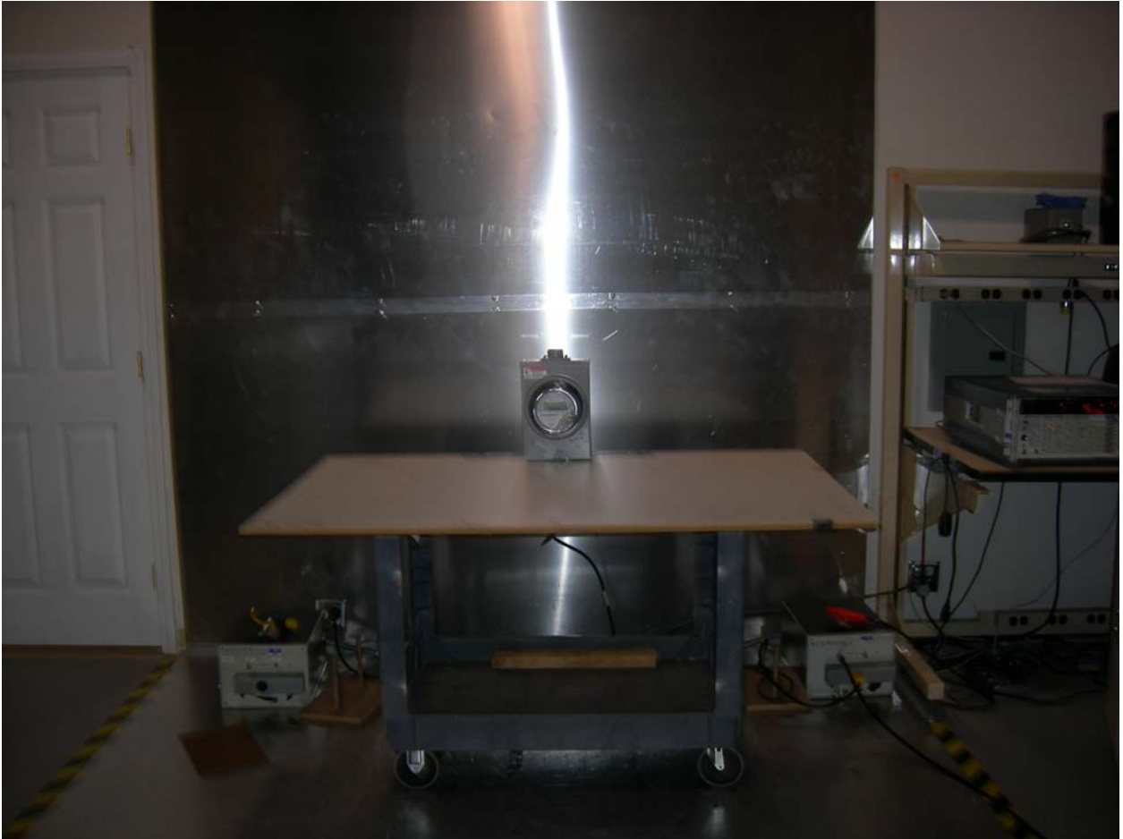
Figure 5: Test Setup – AC Power Line Conducted Emissions