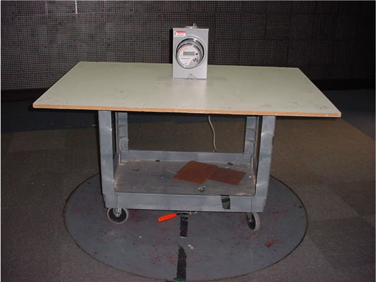
Figure 3: Test Setup – Radiated Emissions - Unintentional