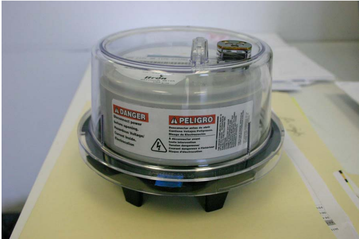
Figure 2: Sample Label – 2 Part Warning Statement