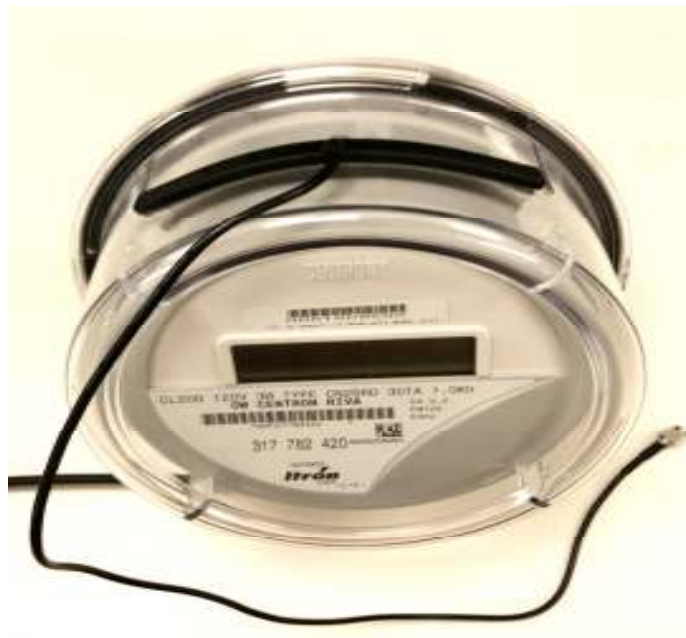
Figure 1: Flex Coupler Assembly

The assembly consists of an Itron flex coupler that fits the outer cover of the meter. This allows for attaching customer provided remote fixed antennas and cabling. See Figure 1 below for a photo of the flex coupler assembly.