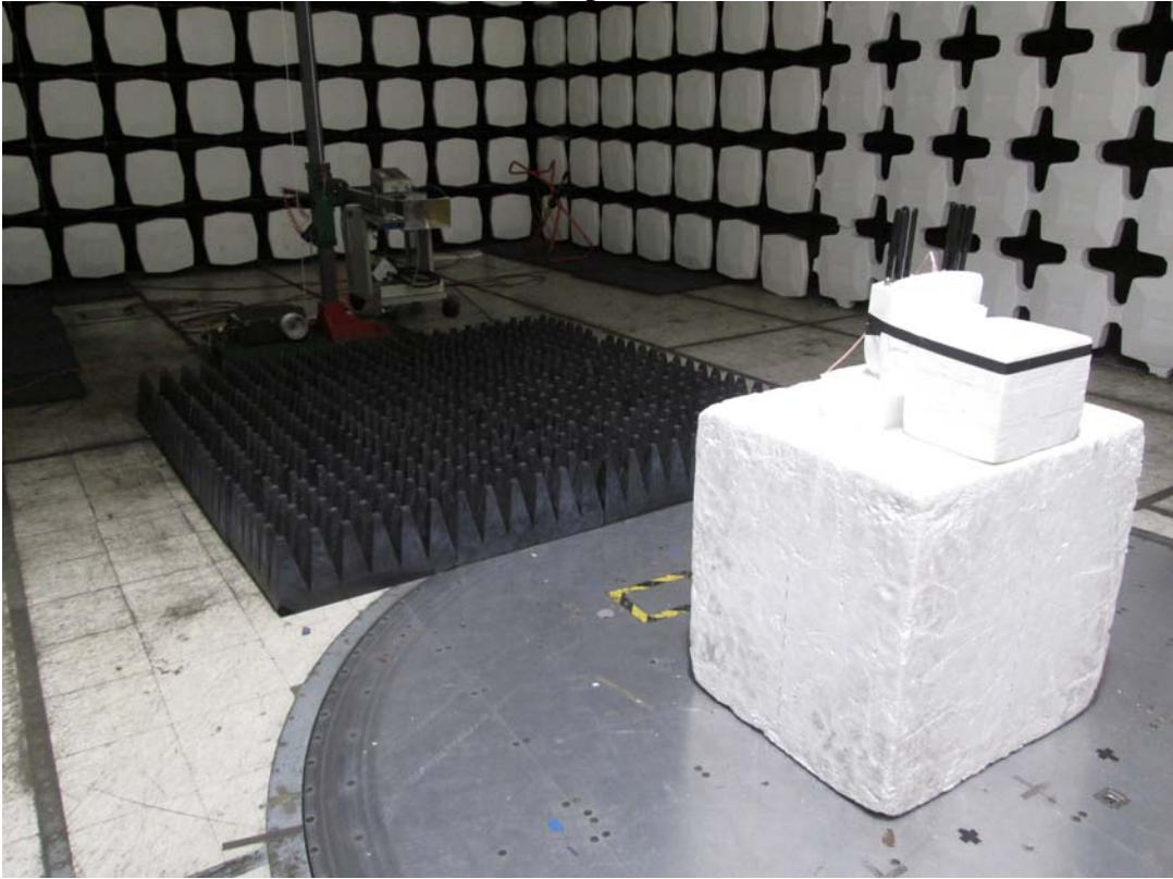
EUT with Dipole Antenna