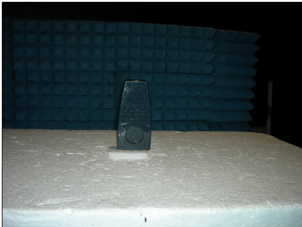
Figure 2: Radiated Emissions