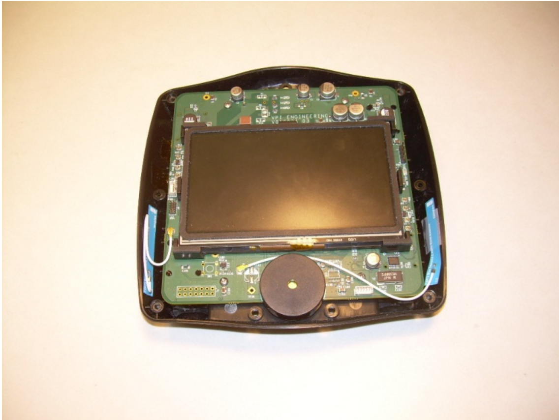
EUT with Front Cover Removed