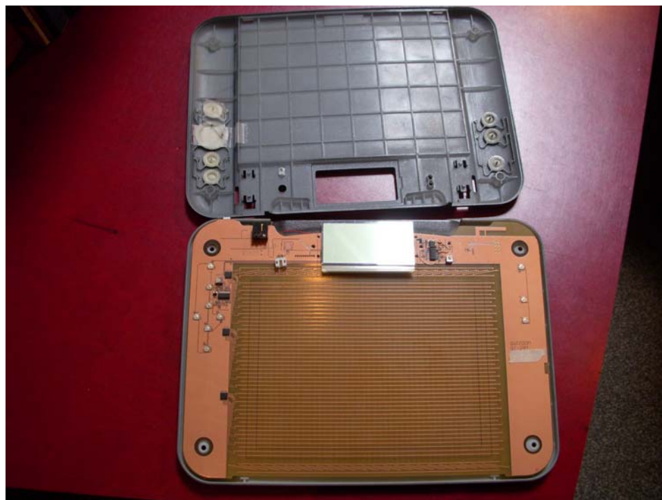
Fig 5 – Q Host circuit board in housing. PCB side 1.